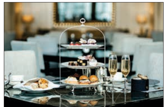
Counterclockwise from top right: The Peninsula Chicago; The Lobby; The Peninsula Suite living room; 25 meter swimming pool on 19th floor; Afternoon Tea collaboration with Sidney Garber in The Lobby; Peninsula Academy V.I.P. Very Important Pet program; Peninsula Academy Grounded in Chocolate experience; Z Bar overlooking Michigan Avenue; Peninsula Academy Chicago by Land, Air and Water

With its astonishing array of award-winning features and unmatched service, The Peninsula Chicago is truly a destination in itself, appealing equally to businesspeople in search of the best in corporate meeting space and leisure travelers looking for the ultimate in luxury and comfort. ●