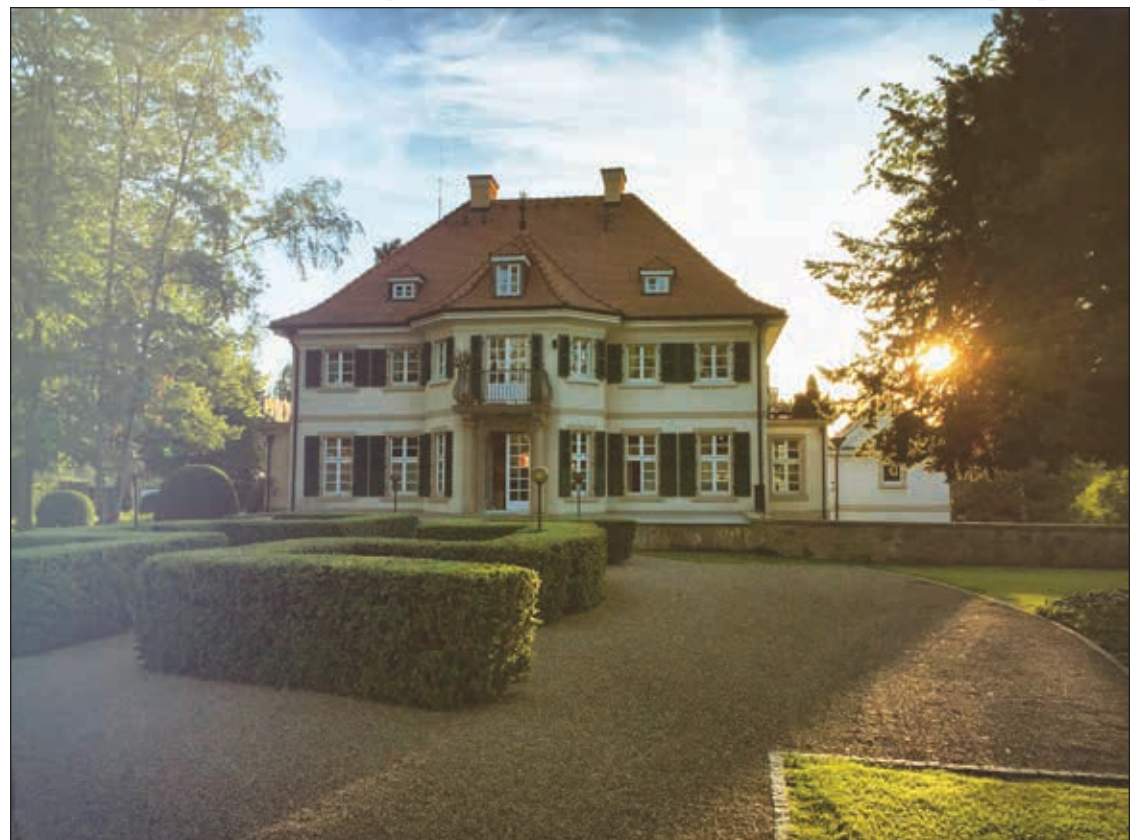
VIMED CELL in Basel, Switzerland

VIMED CELL's mission is to help individuals move beyond fragmented approaches to health toward a more coherent understanding of the human system and the deeper patterns