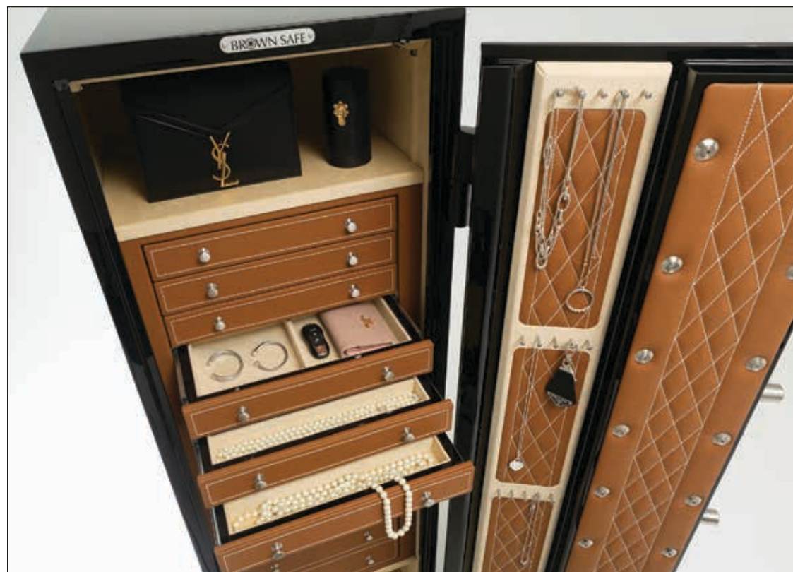
Two of Brown Safe's luxurious and secure safes (above and opposite page)

The Brown Safe difference is the rare combination of impenetrable security, unmatched craftsmanship, and true customization. While