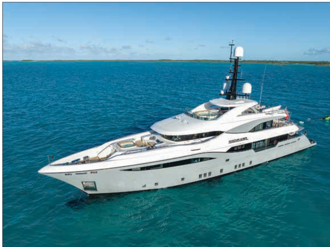
Built in Turkey by Bilgin Yachts, the 47-meter superyacht MOONRAKER showcases Ikonic Yacht's signature balance of performance, sophistication, and modern design

We don't sell, we advise. The difference shows up in everything: how we structure engagements, how we present opportunities, and what we tell a client not to buy. A traditional brokerage gets paid when a deal closes, so the conversation is always pointed at a transaction. Our conversation is pointed at the client's actual life, how a yacht fits into it, when it doesn't, and what the