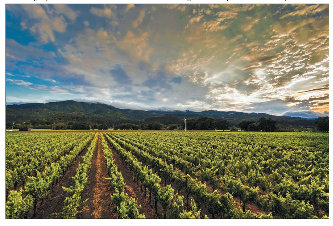
The vineyards of Grgich Hills Estate (above and opposite page)

At Grgich Hills Estate, the commitment to authenticity and balance is at the forefront of our winegrowing philosophy. We strive to craft wines that embody a true sense of place, utilizing minimal intervention winemaking to allow the vintage and vineyard to create exquisite aromas