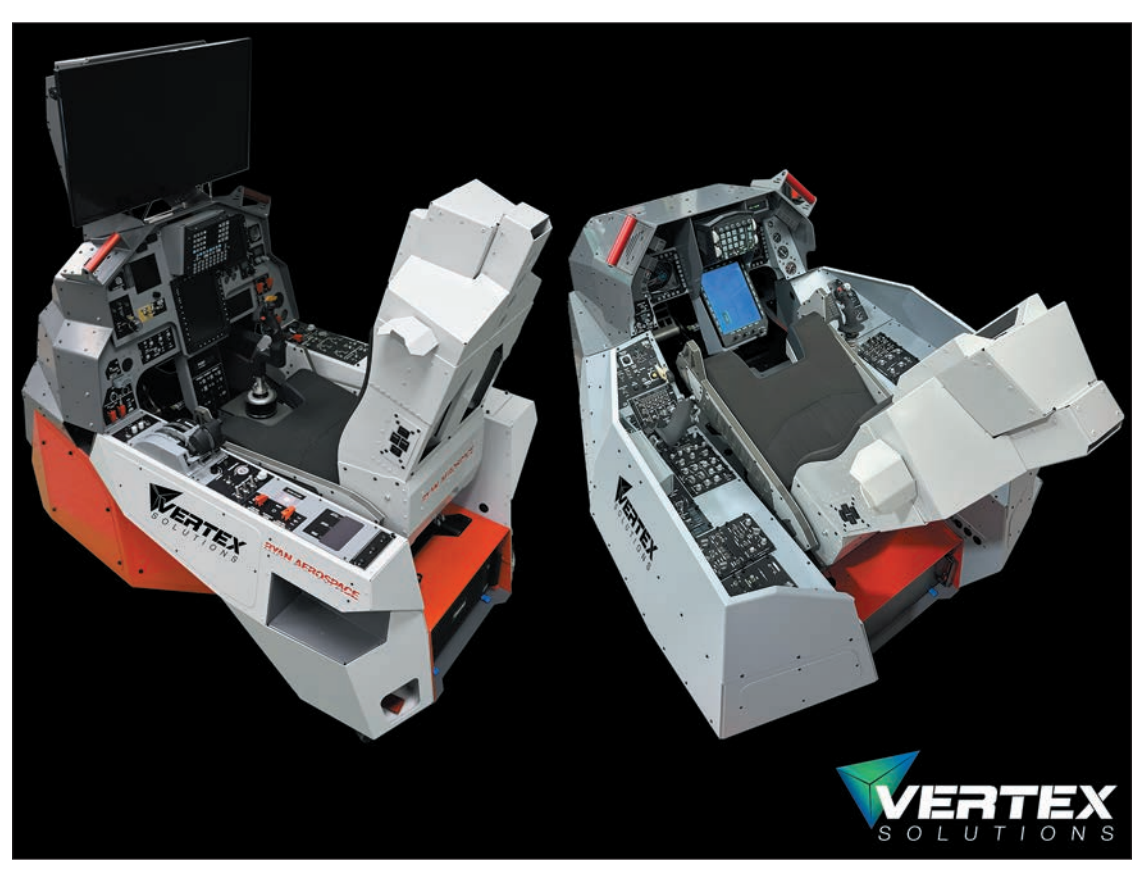
Two of Vertex's family of low-cost, lightweight, reconfigurable MR flight simulators. Developed in conjunction with Defense Innovation Unit and delivered to US Air Force, Air Education and Training Command.

To maintain our leadership in simulation technology, we have developed a proprietary, localized Large Language Model (LLM) tailored to our specific needs. This in-house LLM assists in error checking and summarizing extensive research and documentation, streamlining our development processes. Additionally, we