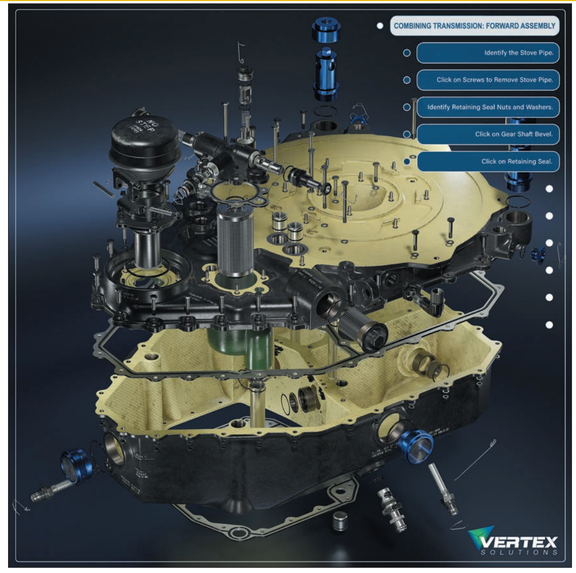
VR Transmission Maintenance Trainer: Hands-on, risk-free training for maintenance and skilled trades – unlocking availability and access to real-world skills training. Delivered to US Army 223rd Aviation Regiment supporting CH-47 maintenance training.

solving. By explicitly articulating, and by personally demonstrating, the behaviors and results that are valued (and rewarded), we ensure that every member of our team is aligned in both thought and action.