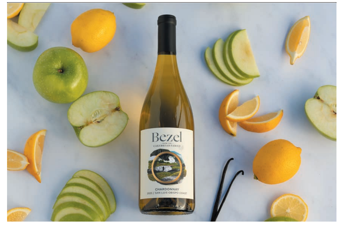
Cakebread's recently launched Bezel, a vibrant, fruit-driven wine

We produce a range of wines, but we're probably best known for our Chardonnay, Cabernet Sauvignon, Sauvignon Blanc, and Pinot Noir. We make 18 wines, including estate-grown bottlings, single-vineyard selections and our Reserve series. Each wine reflects our commitment to balance, elegance, and food-friendliness, which has been a cornerstone of Cakebread since the beginning. Beyond our Napa Valley wines, the Cakebread portfolio now includes Bezel and Mullan Road Cellars, two brands that build on our family's winemaking legacy. Bezel, sourced from California's Central Coast, brings the same craftsmanship to a fresh, fruit-forward style, perfect for more everyday occasions. Mullan Road Cellars, based in Washington's Royal Slope AVA, offers a bold, structured expression of Cabernet Sauvignon that highlights the region's unique terroir. Together, these brands allow us to explore new regions and styles while staying true to our heritage of exceptional quality and thoughtful winemaking.