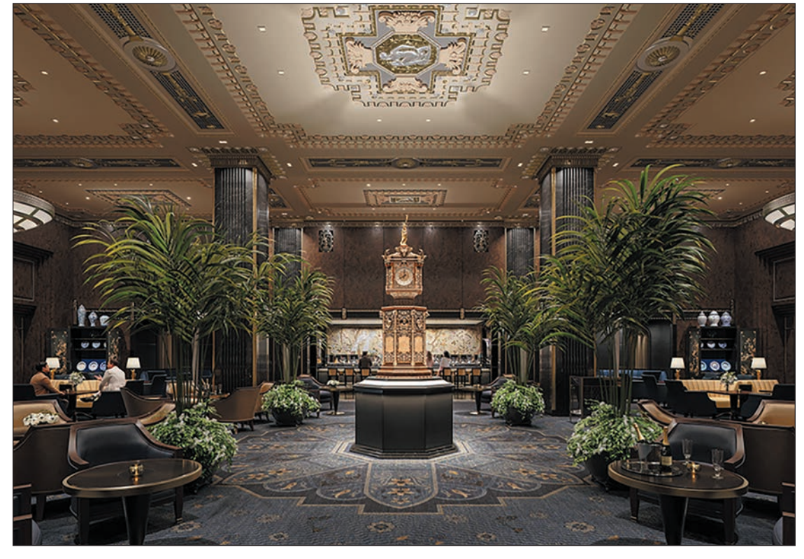
Entrance to the Waldorf Astoria New York (top right); rendering of the lobby (above)

It was essential for Waldorf Astoria New York to establish a strong culinary presence – not