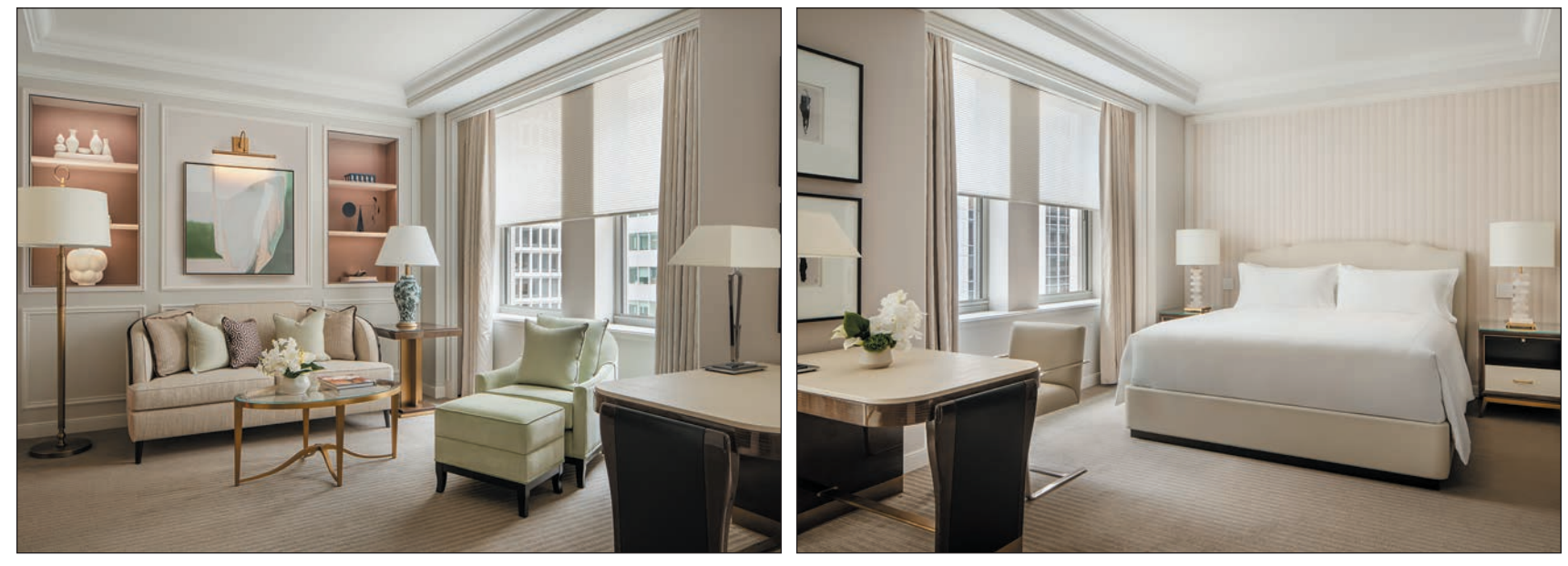
Park Avenue Junior Suite sitting area and bedroom

If you choose hospitality as your career, then give it your all and enjoy the incredible journey it offers. The industry requires a high level of professionalism and a genuine passion for service, but with dedication and perseverance, you can achieve remarkable success. Hospitality is more than a job – it's an exceptional lifestyle filled with enriching experiences, meaningful connections, and opportunities to create lasting memories.