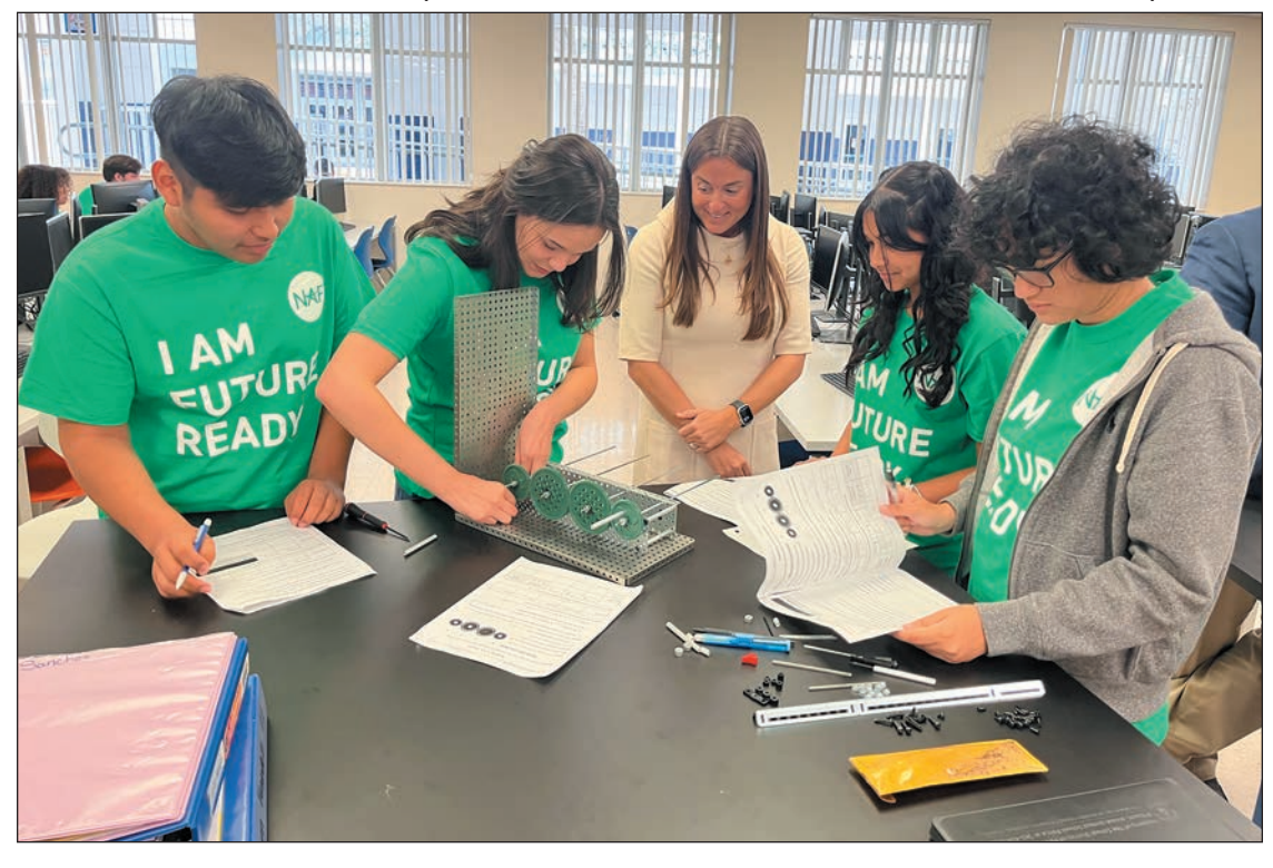
Forest Hill Community High School, Academy of Engineering site visit (West Palm Beach, Florida)

Ultimately, our success is measured by the stories of NAF students who become alumni and remain engaged in our network. These industry connections, mentorships, and experiences extend far beyond graduation, preparing young minds for success in whatever path they choose. As we look ahead, we remain dedicated to expanding our reach and ensuring that every student has the tools to be future ready. •