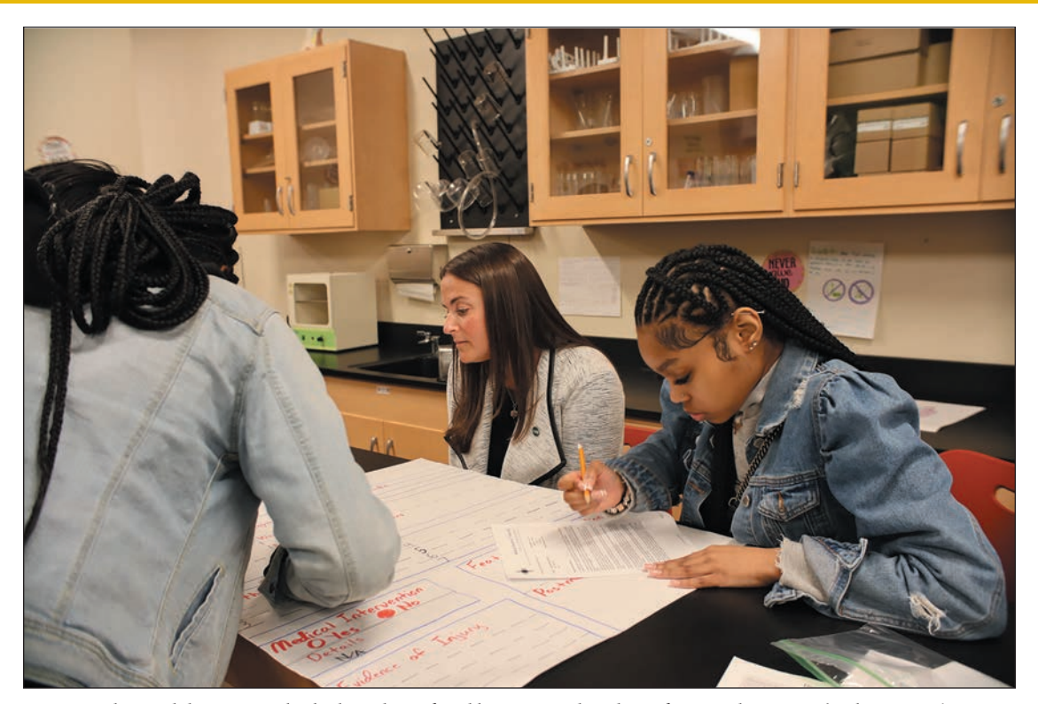
Calvin Coolidge Senior High School, Academy of Health Sciences and Academy of Mass Media site visit (Washington, DC)

offered deeper meaning. When I joined NAF as a director in 2013, I was inspired by the over half a million students it empowered. Now, as CEO, I remain humbled by the opportunity to lead an organization that has shaped the futures of so many young people. For 45 years, NAF has cultivated a generation of skilled, confident, and innovative leaders, contributing to economic growth and workforce development. It is impossible to have a bad day at NAF when you reflect on the 650,000+ lives transformed by our work. My passion endures because there is still much to do - ensuring every student has access to the opportunities they need to succeed. I take great responsibility in strengthening partnerships and expanding our reach to create positive effects for future generations.