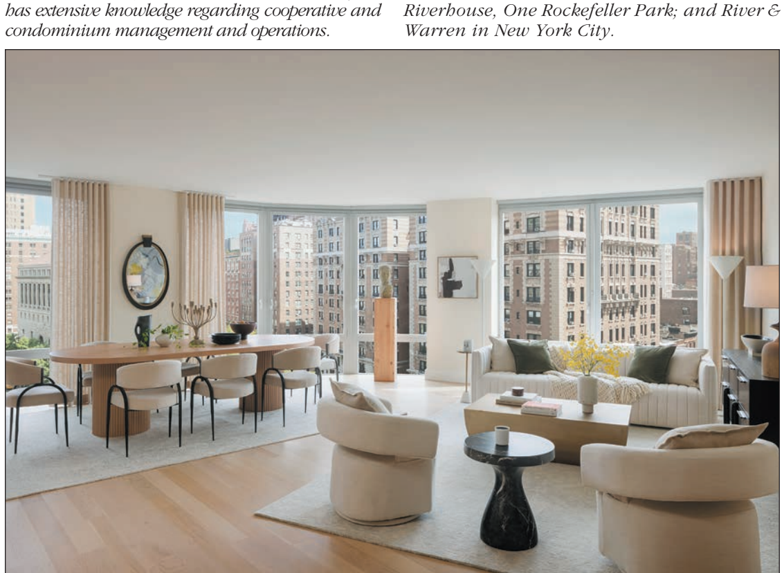
A residence at 212 West 72nd Street in Manhattan (above) and the building entrance (top right)

rion employs a tactical approach with an entrepreneurial mindset to identify opportunities, target complexity, and create value for its investors and partners. Centurion has spearheaded the development and repositioning of several prestigious luxury residential condominium projects, including The Beacon in San Francisco; 212 West 72nd Street; 200 East 59th Street; 33 Park Row; Riverhouse, One Rockefeller Park; and River & Warren in New York City.