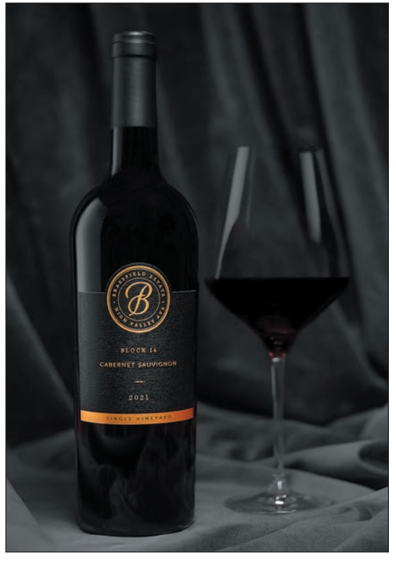
Brassfield Estates single vineyard cabernet sauvignon

Along the way, my business ventures have also spanned a wide range of industries, including investment in BJ's Restaurant & Brewhouse when the chain was starting out, a general partner in a mobile home park construction company, as well as in a group of car dealerships in the Bay Area. These ventures are all under good management, so my heart, my passion, my time, and my mind are now focused on Brassfield Estate Winery.