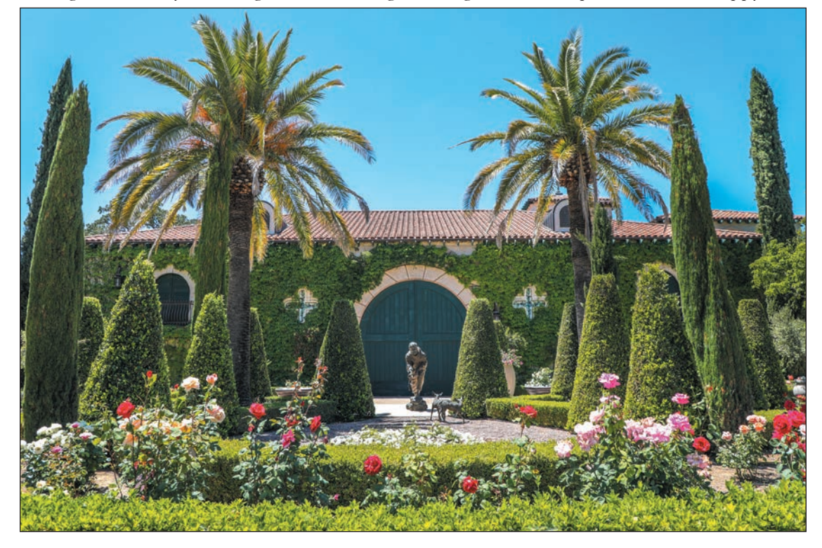
Brassfield Estate Winery

Over the time I've had Brassfield Estate Winery, we've learned how important it is to keep a long-range approach and view. I also firmly believe in keeping our principles intact and what we believe: treat the land right, treat our employees right, treat our wine right, and take the high road – always. We believe that our biggest wins will come from that style of thinking: make great wine, sell at a reasonable price, overdeliver on quality, and treat our customers well, taking that extra step to make them happy. •