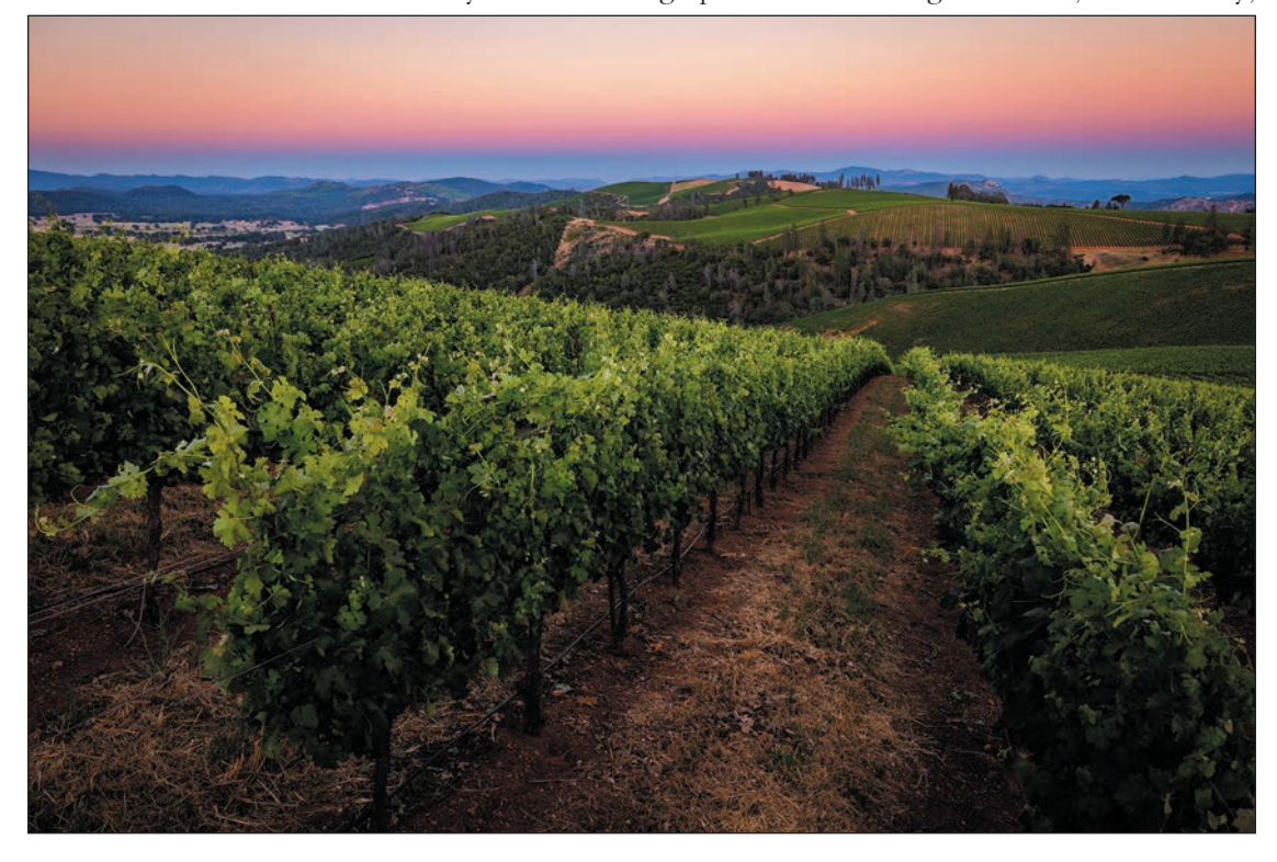
A Brassfield Estates vineyard

At Brassfield Estate Winery, we grow a number of different red and white grapes, crafted into both varietal wines and blends. We handle the production of each single wine from vine to bottle. Our most plentiful vineyards are Cabernet Sauvignon. We also grow other red grapes, including Merlot, Cabernet Franc, Petit Verdot and Malbec, as well as Pinot Noir, Syrah, Grenache, Mourvèdre, Petite Sirah and Zinfandel. Our white grapes include Sauvignon Blanc, Chardonnay,