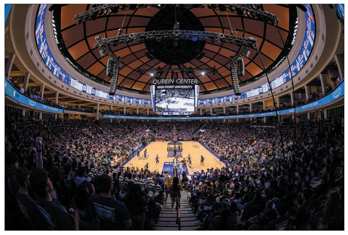
HPU's men's basketball team competing at Qubein Center