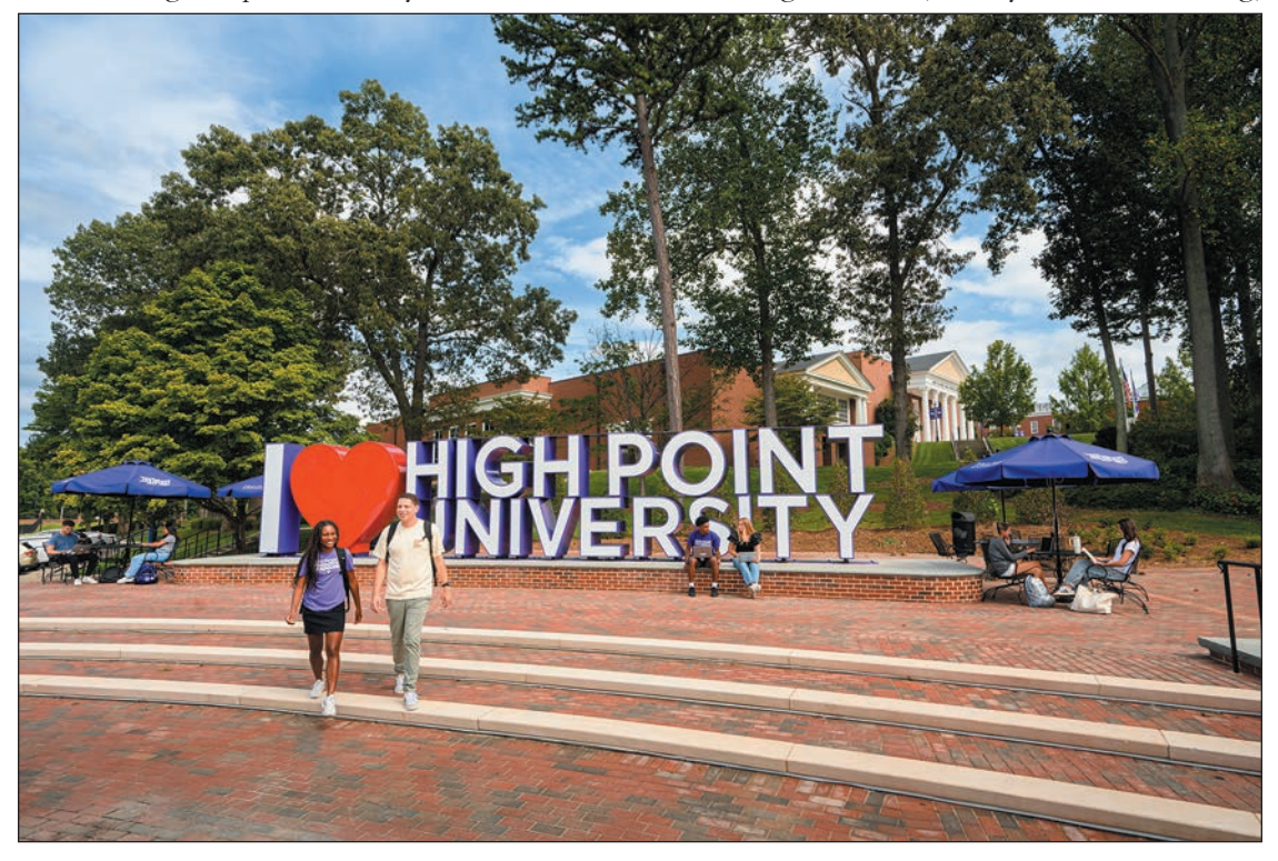
High Point University

I came to this country seeking an education and got it. First, in my formal schooling;