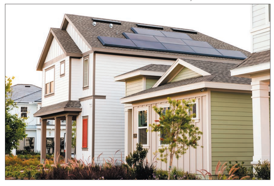
Solar panel installation at Sunbridge, Tavistock's second master-planned community in Central Florida

I would give young professionals the advice to prioritize improving your work-life balance early on in your career. While I've learned to make time for family, friends, and personal pursuits in recent years, I realize now that this balance should have been a focus much earlier in my career.