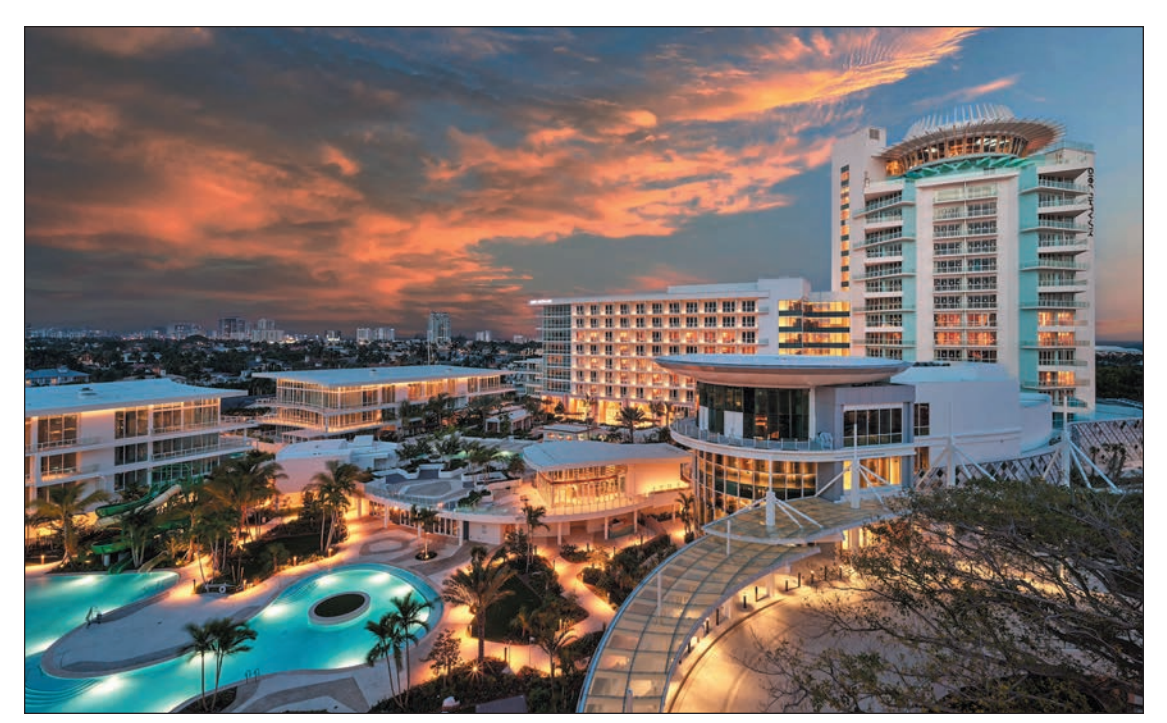
Pier Sixty-Six in Fort Lauderdale, Florida

by both RCLCO and John Burns Real Estate Consulting. As Central Florida's first "naturehood," Sunbridge spans more than 27,000 acres with a significant portion of the development preserving green spaces, waterways, hundreds of miles of trails, lakes, and parks to promote an active outdoor lifestyle. Sunbridge exemplifies our commitment to ecological stewardship through the launch of the Florida Headwaters Foundation and the collaboration with the Osceola County School District, setting a new standard for responsible and innovative growth in Central Florida. Our initiatives, such as the Sunbridge Stewardship Plan, are designed to conserve water, improve water quality, and protect native ecosystems, serving as a model for other communities across the state. Additionally, we've used our influence to foster partnerships with local school districts, ensuring that future generations are equipped with the knowledge and resources to continue this mission of ecological stewardship.