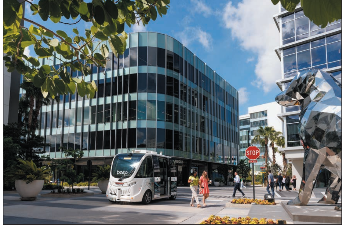
Lake Nona Town Center, a Tavistock development in Central Florida

Sunbridge is Tavistock's second masterplanned community in Central Florida and has been recognized as one of the top-selling master-planned communities in the nation