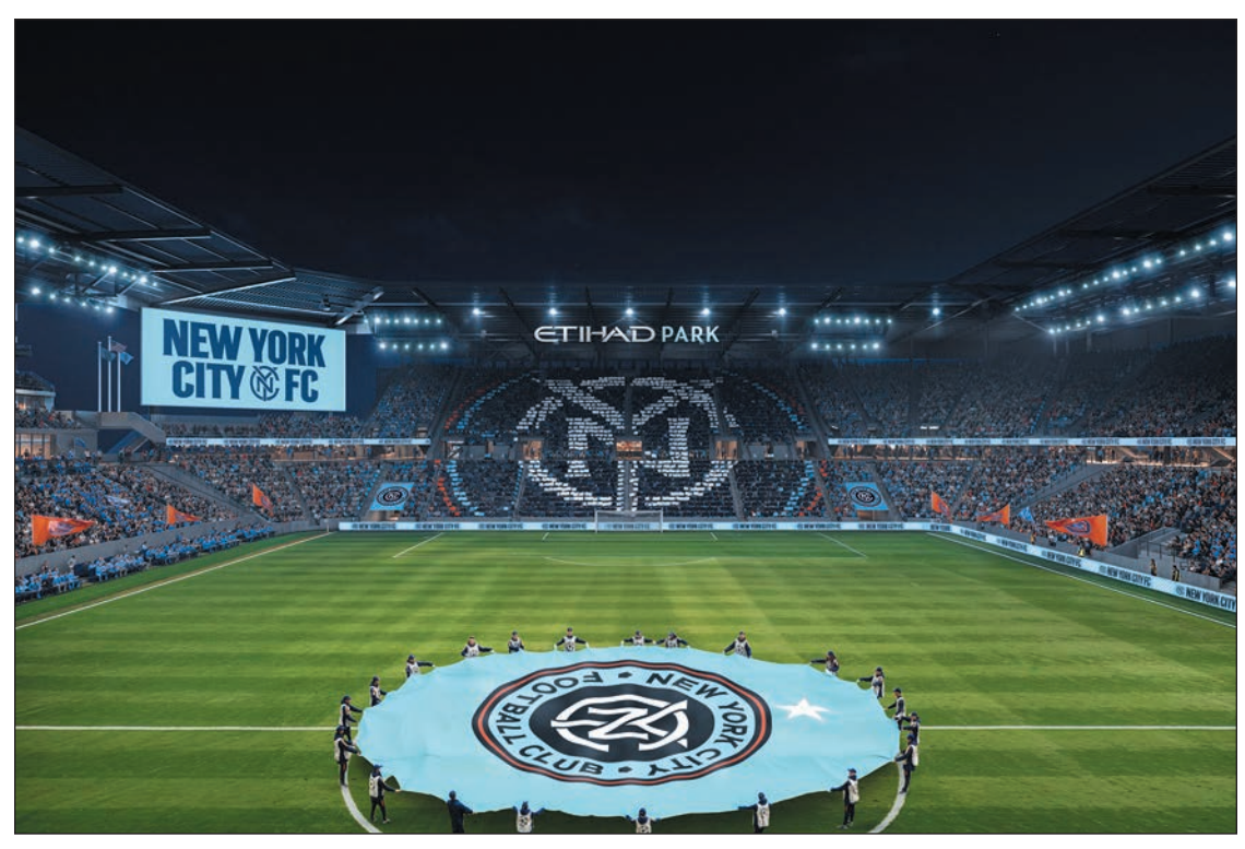
Rendering of the field at Etihad Park

We have amazing fans who have been following us from venue to venue, whether we have been playing at Yankee Stadium or Citi Field or elsewhere. It is special that they will now have a stadium to call their own. We believe that we will have the best purposebuilt facility for soccer in the United States and have a few pillars at the forefront of the fan experience: we want to be authentic to New York City, such as using local chefs as part of our culinary offering; we are committed to sustainability, and this will be the first all-electric outdoor stadium in any sport in North America; we are on a tight parcel of land with