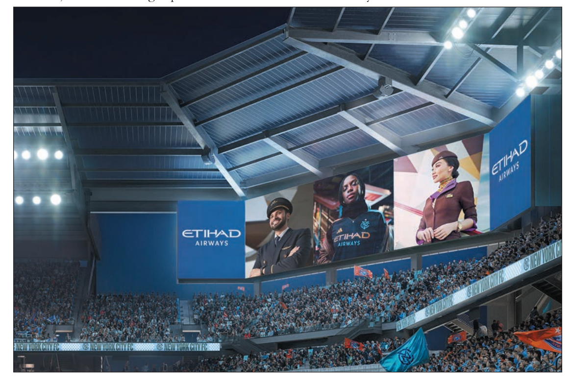
Rendering of the north stands of Etihad Park

I am not great personally at celebrating the wins, mostly because there is so much potential and so much opportunity for the future. In most countries around the world, there is a long history of being soccer-first, but in the United States we are only on the first generation of being soccer-first, and there is much momentum and excitement for the sport in this country. The future is very bright for the sport of soccer. lacktriangle