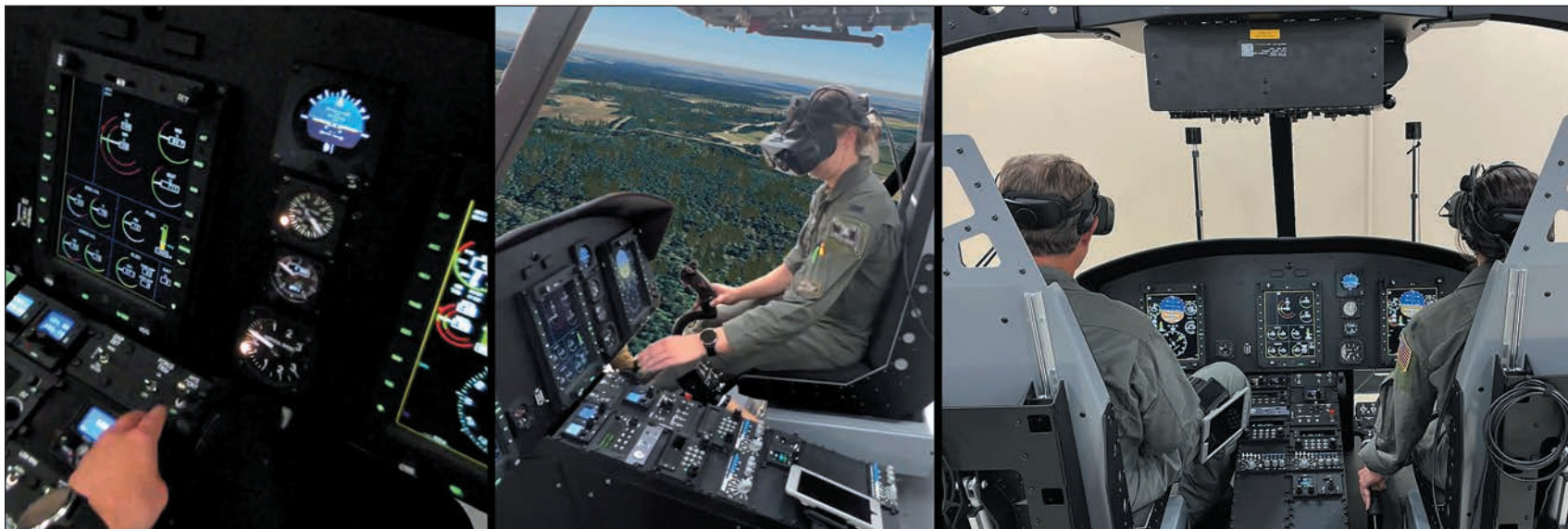
Multi-place Mixed Reality (MPMR) – Integration of real-world avionics within a virtual environment

We have already delivered more than 300 of our simulators to the Air Force, the Navy and commercial aviation customers. This spring, we will have employees providing pilot training with our XR simulators at nine military installations and one airline. We are also partnering with one of the leading eVTOL developers, producing a similar XR simulator for them with the expectation of receiving FAA certification for flight equivalency training.