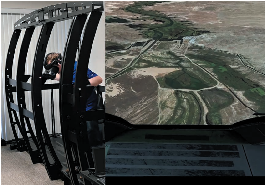
Military Freefall Jumpmaster Virtual Training System (MFF JM-VIS) – Immersive training for any job performance environment

In all of what we do, I am white knuckled over holding to my moral compass: surprise and delight your team, your family, your friends, even yourself and strangers, because the positivity you gain by helping someone learn and live better makes you better.