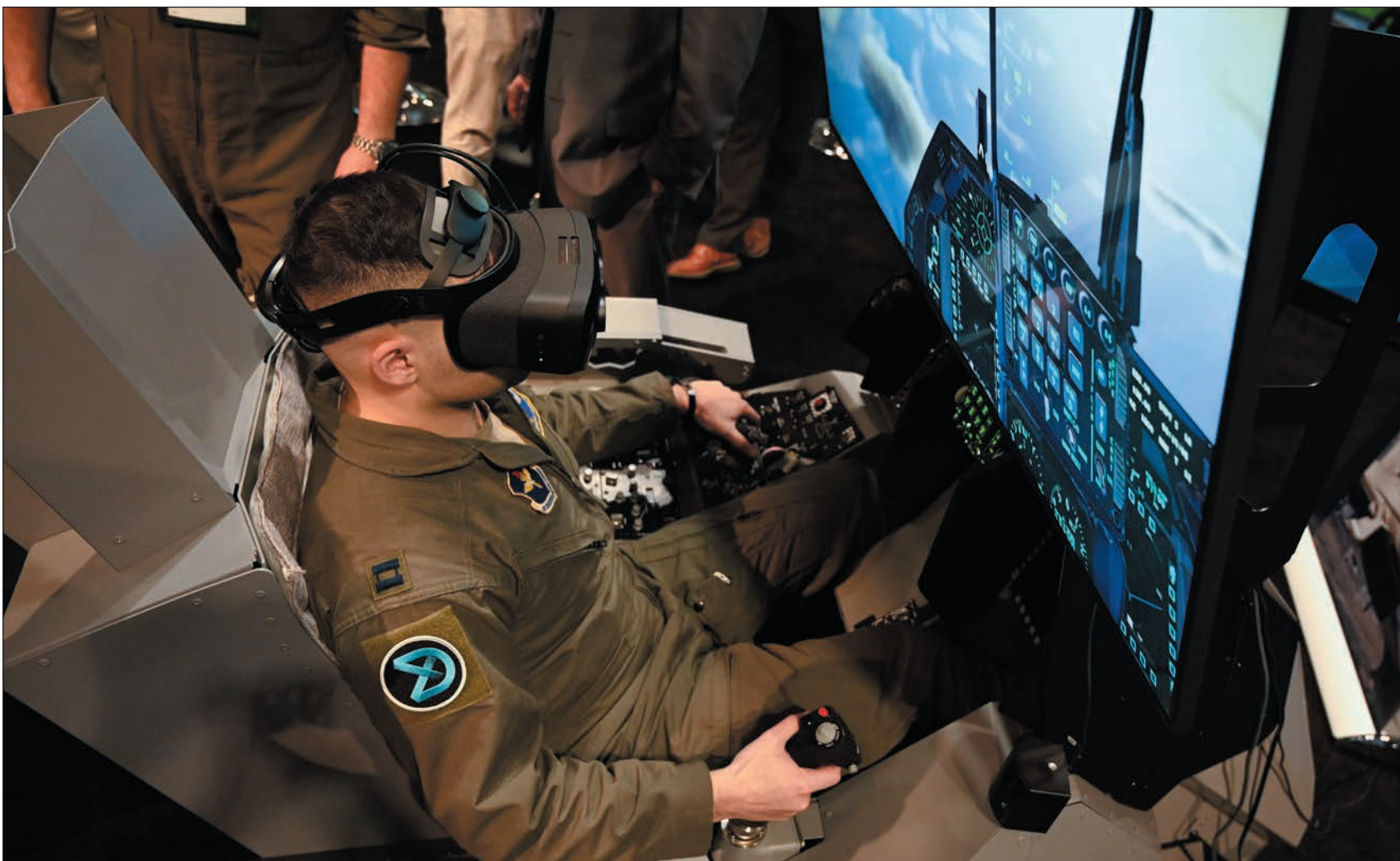
F-16 Mixed Reality Reconfigurable Fighter Trainer (MR-RFT) – Vertex delivers numerous mixed reality aircraft configurations (The appearance of U.S. Department of Defense (DoD) visual information does not imply or constitute DoD endorsement)

As hundreds of pilots are actively using our XR flight simulators, we gain continuous and invaluable access to a rich source of user acceptance data. There are very few companies that deliver similar XR simulators at this scale that also undergo daily use by instructor and student pilots. We make high fidelity training accessible, responsive, current, and affordable, bringing the training to our users, addressing the costly (in terms of dollars and time) problems of where to train so we can focus on the how.