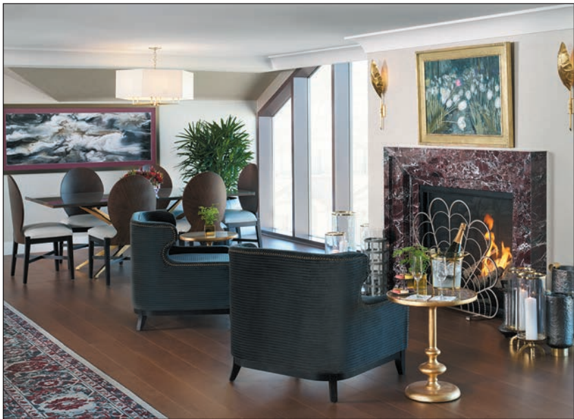
Living room sitting area