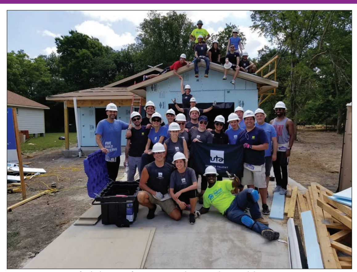
After the devastation of Hurricane Harvey, the UTA Foundation traveled to Houston with a team of agents to help create affordable housing with Habitat for Humanity (above)

It has been an incredible opportunity to establish a division within a supportive and fast-growing company that has been successful both as a business and as a dedicated member of their community. I feel lucky every day to show up, work with a dynamic team and have the opportunity to tackle some of the most pressing problems of our time. It is truly an honor to have a dream job, and we look forward to celebrating the 20th anniversary of the UTA Foundation next year. lacksquare