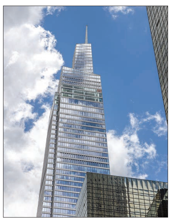
One Vanderbilt Avenue

It goes without saying that real estate industry has long been a male-dominated industry, though I am happy to see that now more than ever, there are increasingly more opportunities for women to grow and succeed in this sector. Female mentorship, particularly through having a great support system, is an extremely valuable tool that will encourage young, passionate women to grow in the sector. I'm proud to serve as a mentor to many incredible women within my team, and hope these young women continue to pay it forward as well.