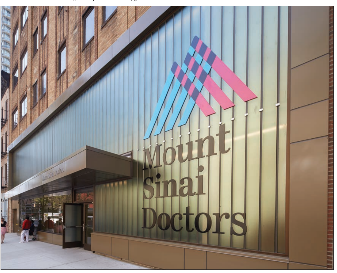
Mount Sinai Doctors facility on East 85th Street in Manhattan

"We will continue to meet the needs of patients in communities where they live and work, when and how they need us."