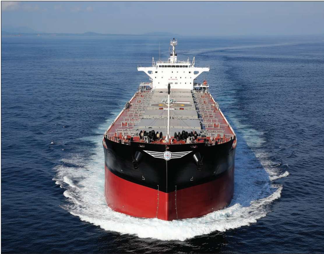
Ships from the fleet of Foremost Group (this page and the next)

reputation for its commitment to exceptional service and performance, while always holding itself to the highest ethical standards. We charter our ships to the world's leading dry bulk charterers, including such valued clients as Bunge, Cargill, Louis Dreyfus, MOL, NYK, and Oldendorff. It is the charterers who determine what cargo the ship will carry, where the cargo will be loaded, and where the cargo will be discharged during the agreed-upon contract period.