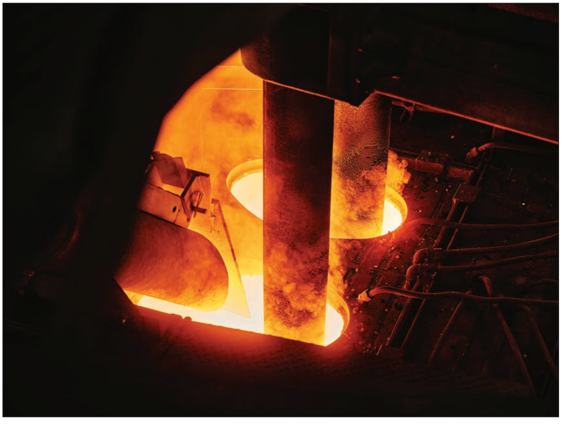
Recovering metals at the Sabin Metal West facility in Williston, North Dakota

Sabin's mission is to extract the maximum possible value from industrial byproducts and waste through efficient and sustainable practices, returning precious metals back to society to help meet the demand for these important resources. We feel we are the world leader in innovative and responsible precious metals recovery and refining, measured by customer satisfaction and market share.