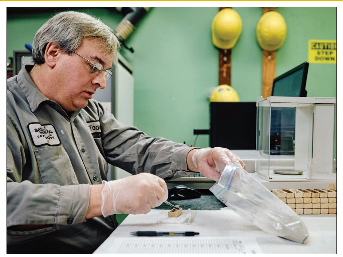
A Sabin technician at work (above) and recovered metals (below)