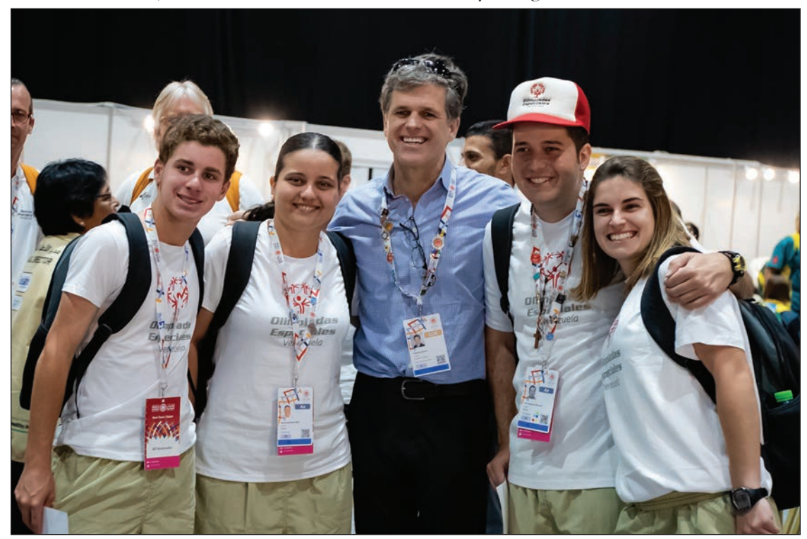
Timothy Shriver poses for a photo with members of the delegation from Venezuela during their visit to Healthy Athletes at Special Olympics World Summer Games Abu Dhabi 2019

The pandemic showed us that we are able to shift priorities from an organization-wide perspective in a way that worked for grassroots stakeholders on the ground in nearly 200 countries. As the world figures out what the new normal is – post-pandemic and as social justice goes from being a movement to becoming an expectation – Special Olympics is here to remind people that diversity goes beyond gender identity, race, ethnicity, or sexuality; it also includes every kind of human diversity and gift. •