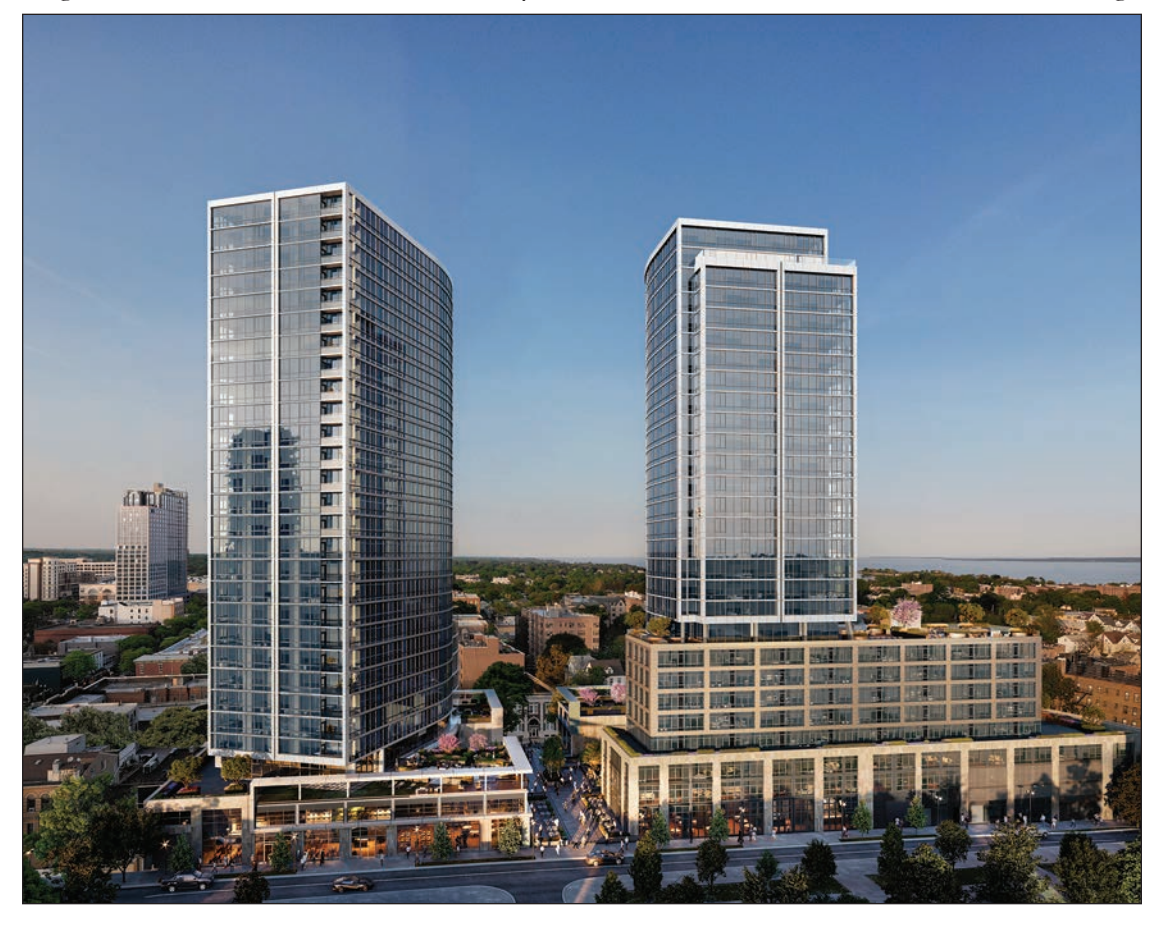
Rendering of One and Two Clinton Park in New Rochelle, New York

However, as we grew this student housing business, our Reckson shareholders made it clear that they wanted us to remain focused just on New York office and industrial space, and not student housing. With this pressure, we took the student housing company public in 2004, and it grew to become the largest student housing company in the world. But we were frustrated that we were forced to divest Reckson's interest right as ACC's growth began to accelerate. We faced a similar challenge