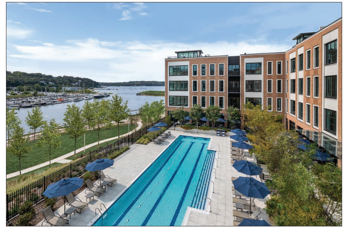
The Beacon at Garvies Point in Glen Cove, New York

We are also committed to having diverse talent work on our development projects. A good example is our master development in Downtown New Rochelle, where we are attracting a diverse group of workers, particularly from the local community. For each project, we begin job training a year before we start construction, and we hold a series of job fairs with the different building trades performing work on the project. We are constantly seeking ways to leverage our developments to benefit the communities where we operate. At our JFK project in Southeast Queens, we have committed to 30 percent MWBE (Minority- and Women-owned Business Enterprise) participation across the over $4 billion project and we're also hiring talent from the local community.