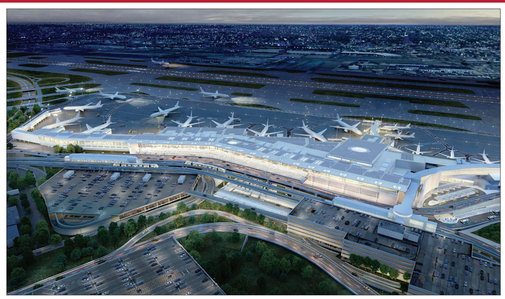
Rendering of Terminal 6 at JFK Airport

knowledge worker, but there are other parts of the country where this talent has migrated, so we decided to target those specific markets. We focused on places that had good education systems, good healthcare systems, and leadership invested in improving infrastructure and quality of life - or what we commonly refer to as Eds, Meds, and Well-Led cities. We believed that we could take the model that had been so successful for us in New York by targeting the outer ring of other cities that had the necessary transportation hubs that allowed people to get back and forth quickly from the city's center to create high-quality housing at an affordable price. So, we're investing in those growing Superstar Cities that now have the added potential to become Superstar Regions.