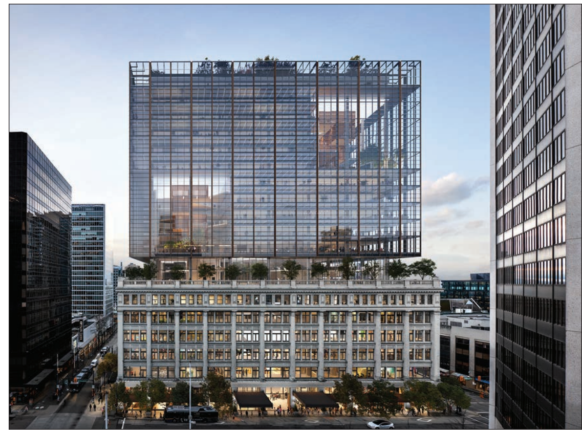
HBC's flagship building in Vancouver (above and opposite page)

That is a great question. First, we have to zoom out a bit. We have acquired, assembled and invented a whole series of companies that