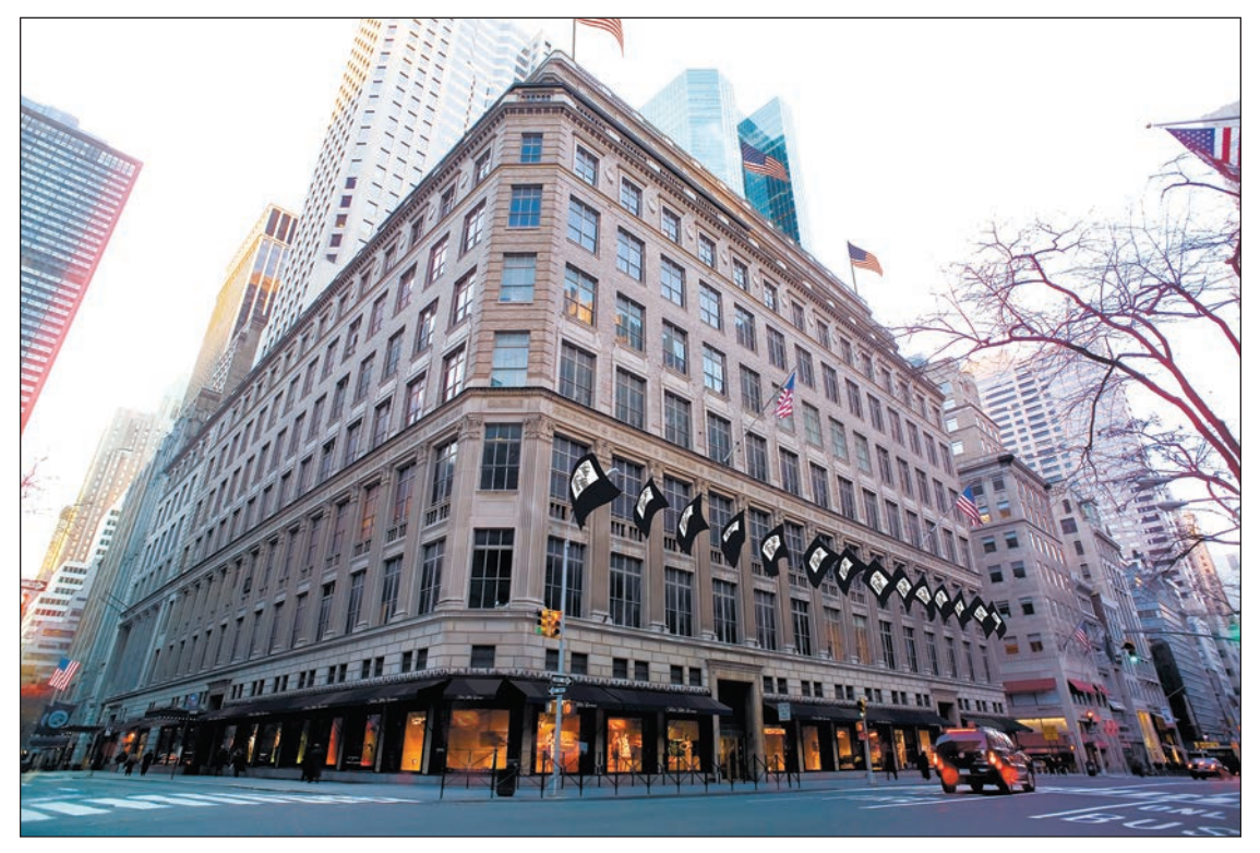
Saks Fifth Avenue's flagship store in New York City

deliberate decision to split our digital businesses from their brick-and-mortar counterparts, which were already separated from our real estate business. As a result, each of our four core brands has its own digital, operating, and real estate arms. With this approach, we are not only able to attract real estate, digital, and operating company investors and increase our competitive advantage, but also bring established brands into a new era of agility and innovation.