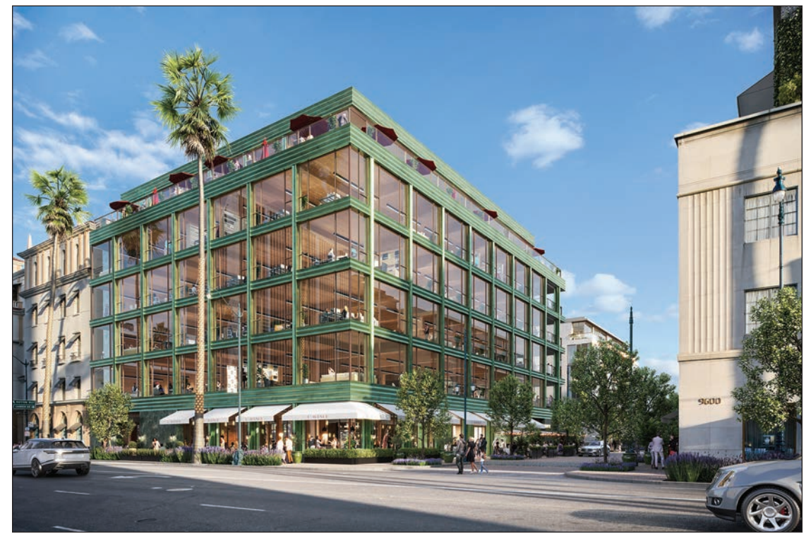
HBC's expansion of Saks Fifth Avenue Beverly Hills

We certainly have big aspirations and plans for the future, and I'm excited to see where we go next. But I also believe that, as you get older, you begin to appreciate the journey. When I think about what we have accomplished over the years, I'm humbled. And inspired. What started with a $25 million check in 2006 has grown into an enterprise over $6 billion – more than we ever could have imagined. In a way, acknowledging how far we've come brings even more anticipation for the future.