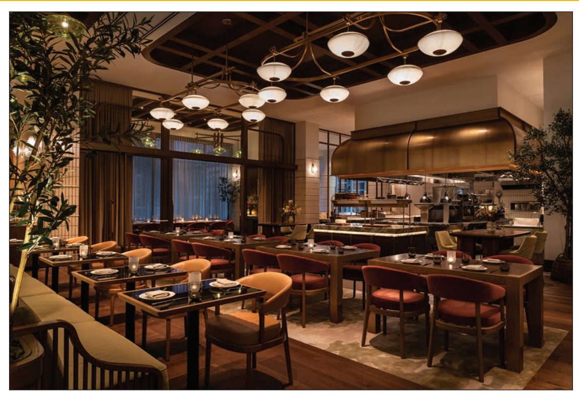
Mara Restaurant & Bar

We have more than 20,000 square feet of indoor and outdoor event and meeting space, and in every area, you'll find natural light. Since the first big event on Opening Day back in June, our team has continued to outdo themselves. The ballroom ceilings and spaces are customizable, so we've seen everything from a Charlie and the Chocolate Factory activation to stunning weddings to corporate