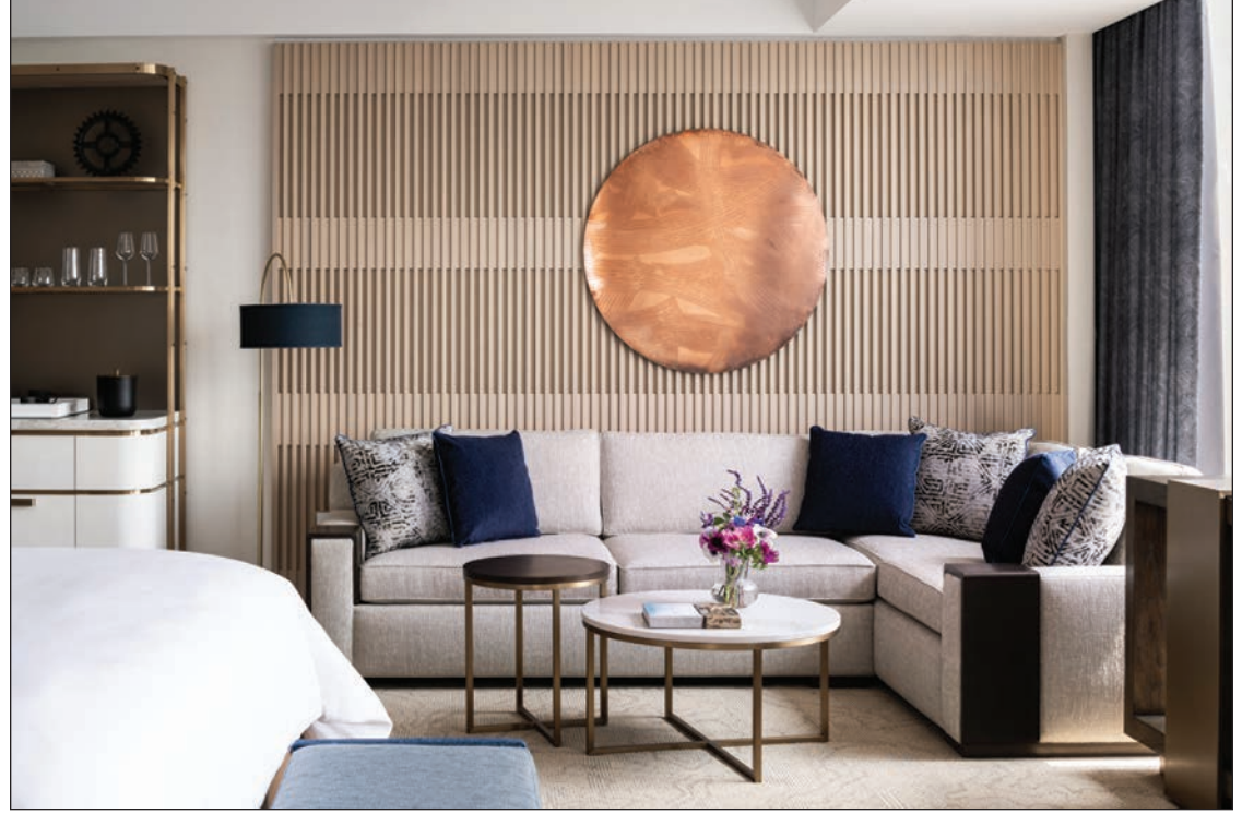
Skyline Executive Suite

PROPERTY BRIEF Rising 36 stories above Minneapolis and firmly rooted in its dynamic downtown, the all-new Four Seasons Hotel Minneapolis (fourseasons.com/Minneapolis) boasts 222 spacious rooms, all with unobstructed, inspiring views; new dining concepts by local award-winning chef and restaurateur Gavin Kaysen; more than 16,000 square feet of indoor event space; and an entire floor dedicated to wellness and fun – complete with an evolving and sustainable spa, an indoor pool