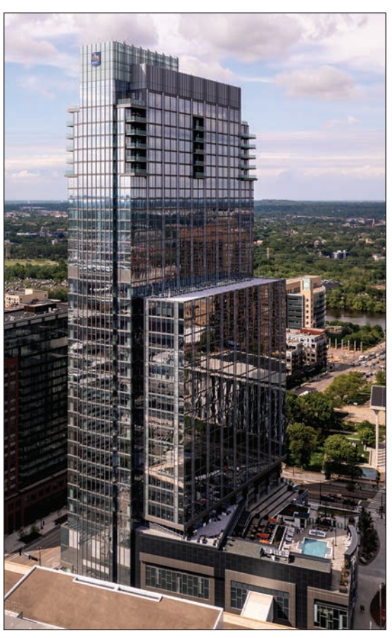
Four Seasons Hotel Minneapolis

with floor-to-ceiling windows, and an outdoor pool on the city's largest terrace. Four Seasons Hotel Minneapolis is also home to 34 fully serviced Four Seasons Private Residences on its uppermost floors.