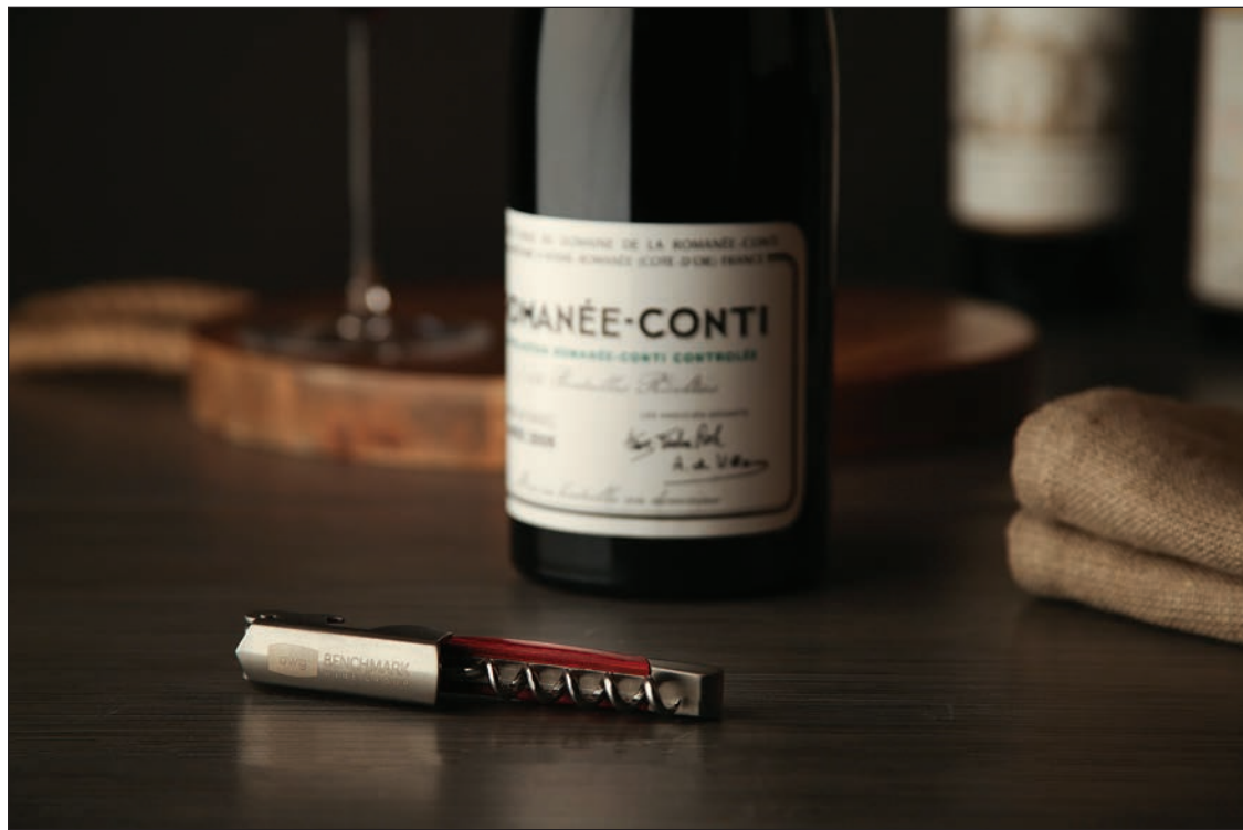
A bottle of Domaine de la Romanee-Conti Romanée-Conti Grand Cru

We have grown from being a broker of a couple hundred different rare wines with first year sales of about $1 million to the largest rare wine retailer in the country, with over 15,000 rare wines in stock at any given time and revenue more than 40 times as large as what we achieved that first year. We have gone from sourcing products from one