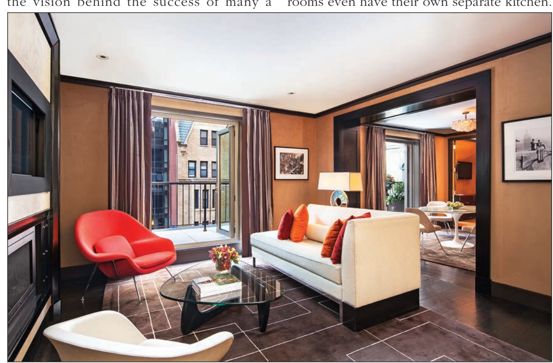
Producer Suite living area

We have some of the most charming banquet and meeting rooms in New York City, like the Stanford White Room and the Club Rooms. The Stanford White room used to be a library of the thespian club that had occupied this building for about 100 years. It's library theme, with a working fireplace and a beautiful terrace, provides for an ideal space for intimate social events and celebrations as well as the most efficient and sophisticated meetings. The Club Rooms are themed as wine cellars, which they were historically. All meeting rooms have their own restrooms and coat checks. The banquet and events rooms even have their own separate kitchen.