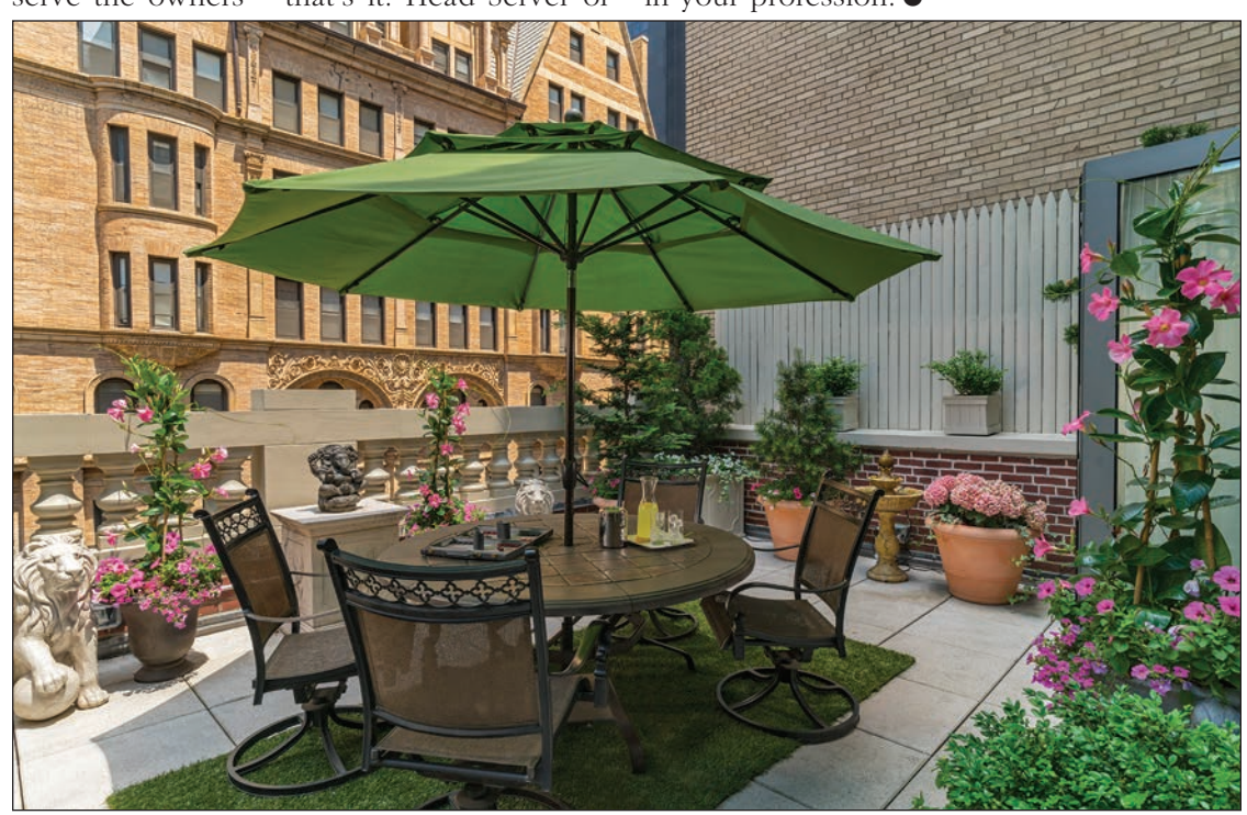
Sanctuary Suite private terrace

There are no half measures. If you really want to build a career in the hospitality industry, give it your all and that really goes for any industry you choose for that matter. My advice to the young would be that a sincere commitment should be fundamental to your choice and then the results will take care of themselves. You will hopefully enjoy what you choose if your heart is completely in your profession.