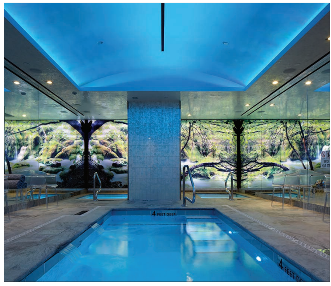
The Chatwal, New York swimming pool

So, the planned and carefully created meetings space make The Chatwal ideal for board stays, corporate retreats, weddings, and milestone celebrations. Charming accommodations to stay in and historic meeting rooms for events can all be found under one roof at The Chatwal, New York.