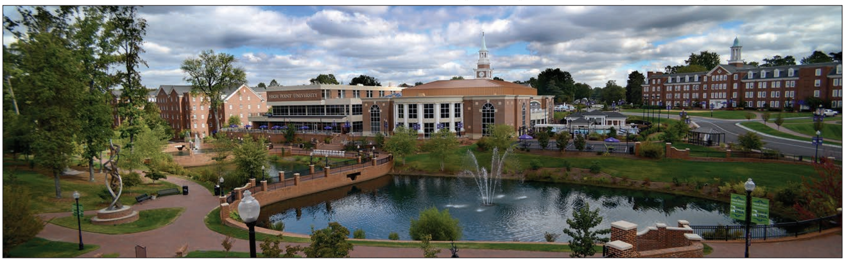
The campus of High Point University (above and opposite page)

While I was in college, I worked as a youth counselor and sought out leadership materials that would help youth counselors grow professionally. I couldn't find any, so I started a business to provide leadership materials for people like myself. I also