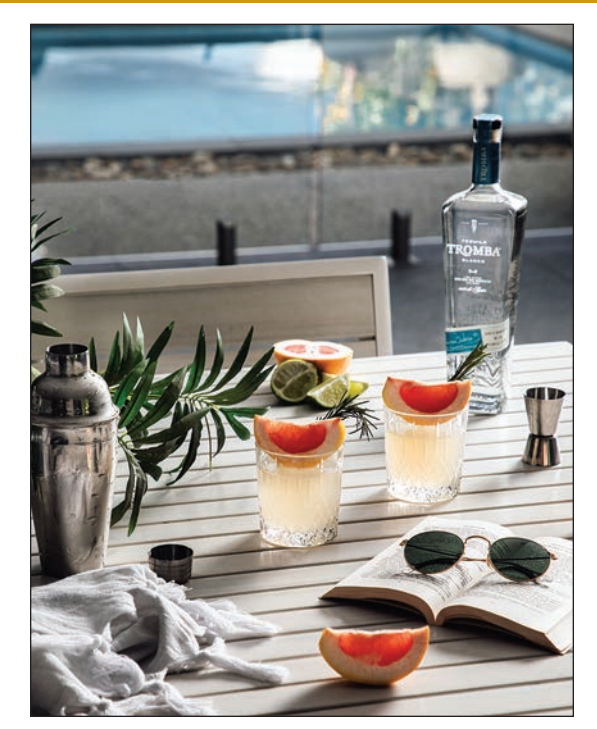
Tequila Tromba Blanco

It's key. The education and knowledge of