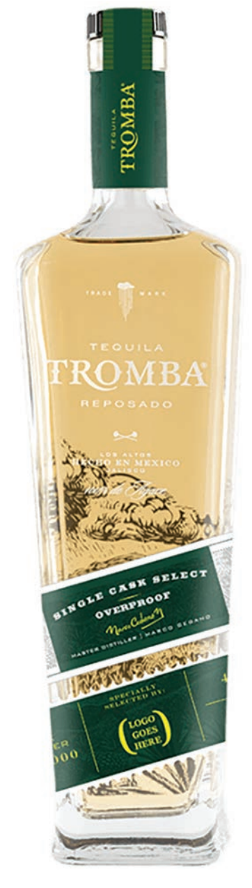
Tequila Tromba Reposado Single Cask