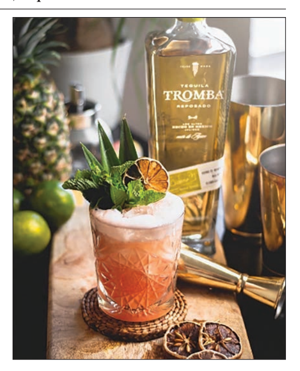
Tequila Tromba Reposado

I've always had an entrepreneurial itch and I saw a gap in the tequila market. Not being an