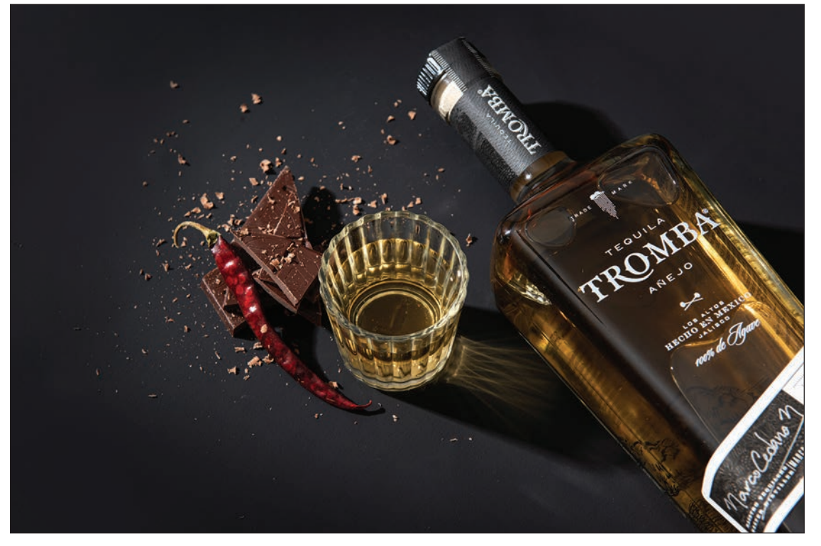
Tequila Tromba Añejo