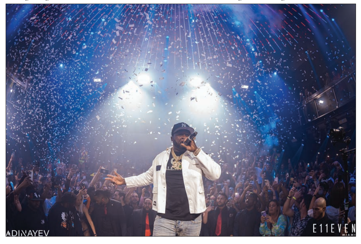
50 Cent (above) and Travis Scott (top) performing at E11EVEN Miami

Today, E11EVEN has become a lifestyle brand with a mission to increase the presence of E11EVEN by continuing to expand our verticals into other categories on a global scale.