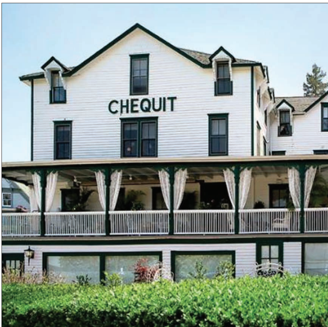
The historic Chequit Inn on Shelter Island, New York, which was restored by Soloviev Group