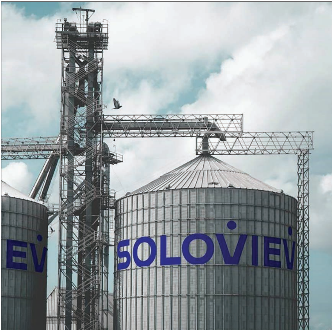
A Soloviev grain silo, part of the company's sophisticated logistics network

fought the scrapping of the line in Washington D.C. before the Surface Transportation Board, and I won the right to purchase the line after a five-year battle.