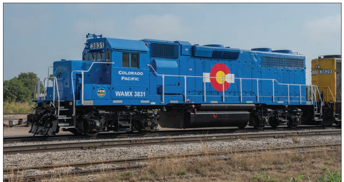
A locomotive of the Soloviev Group-owned Colorado Pacific Railroad, used to transport grain from Kansas and Colorado farms to the major markets

You recently sold Soloviev's residential property portfolio in New York City for $1.75 billion. Are more sales of New York real estate to come?