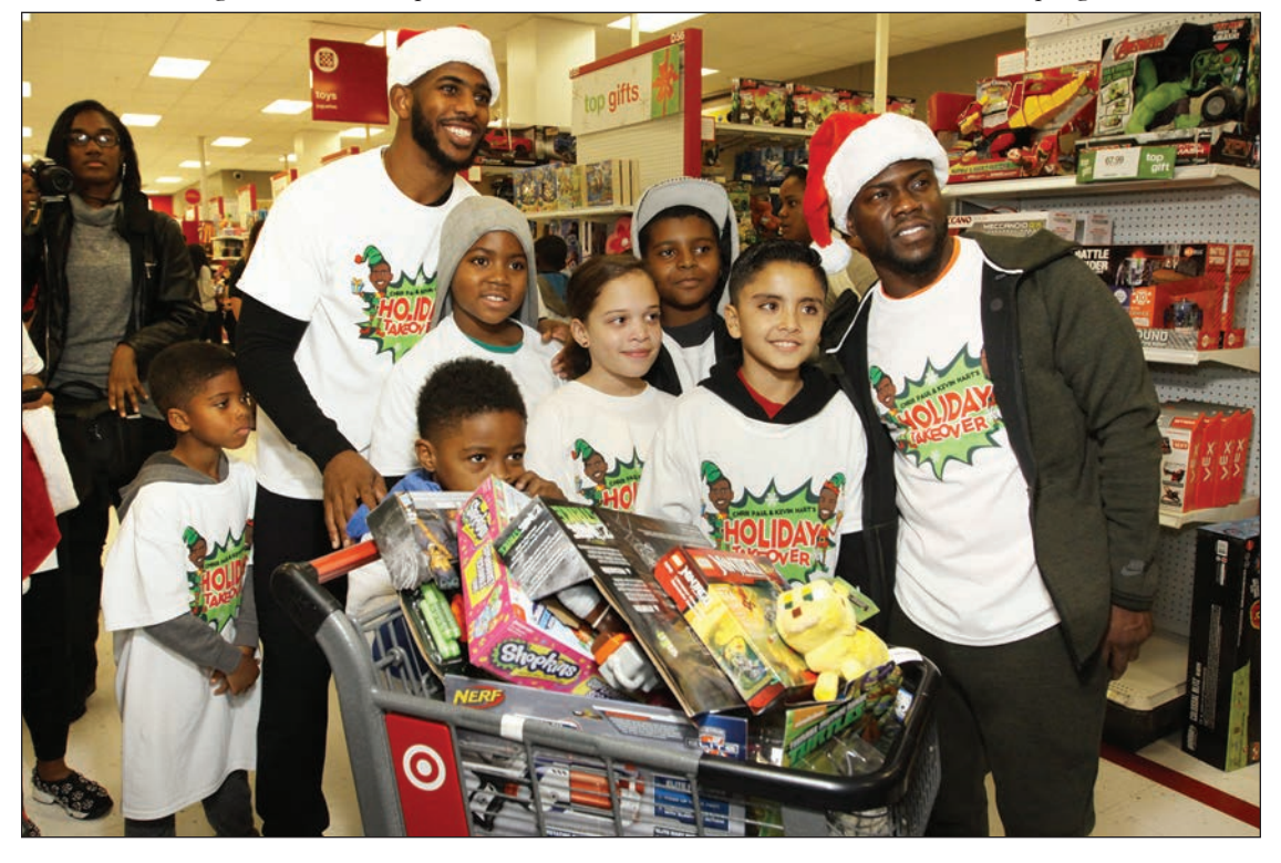
Holiday Christmas Takeover in Los Angeles, 2015

The pandemic allowed us to pivot our work to support some of the critical organizations that were in the field helping communities