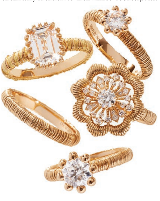
Rings from Oscar Massin

We met the founders of Latitude Diamonds, the first and finest 100 percent climate-neutral stones to be SCS-certified for sustainability and assessed according to the core standards of ethical stewardship. We learned the tremendous environmental benefits of lab-grown diamonds and their ability to drastically reduce both legacy and current emissions. We also saw that the diamonds themselves are physically and chemically identical to their mined counterparts.