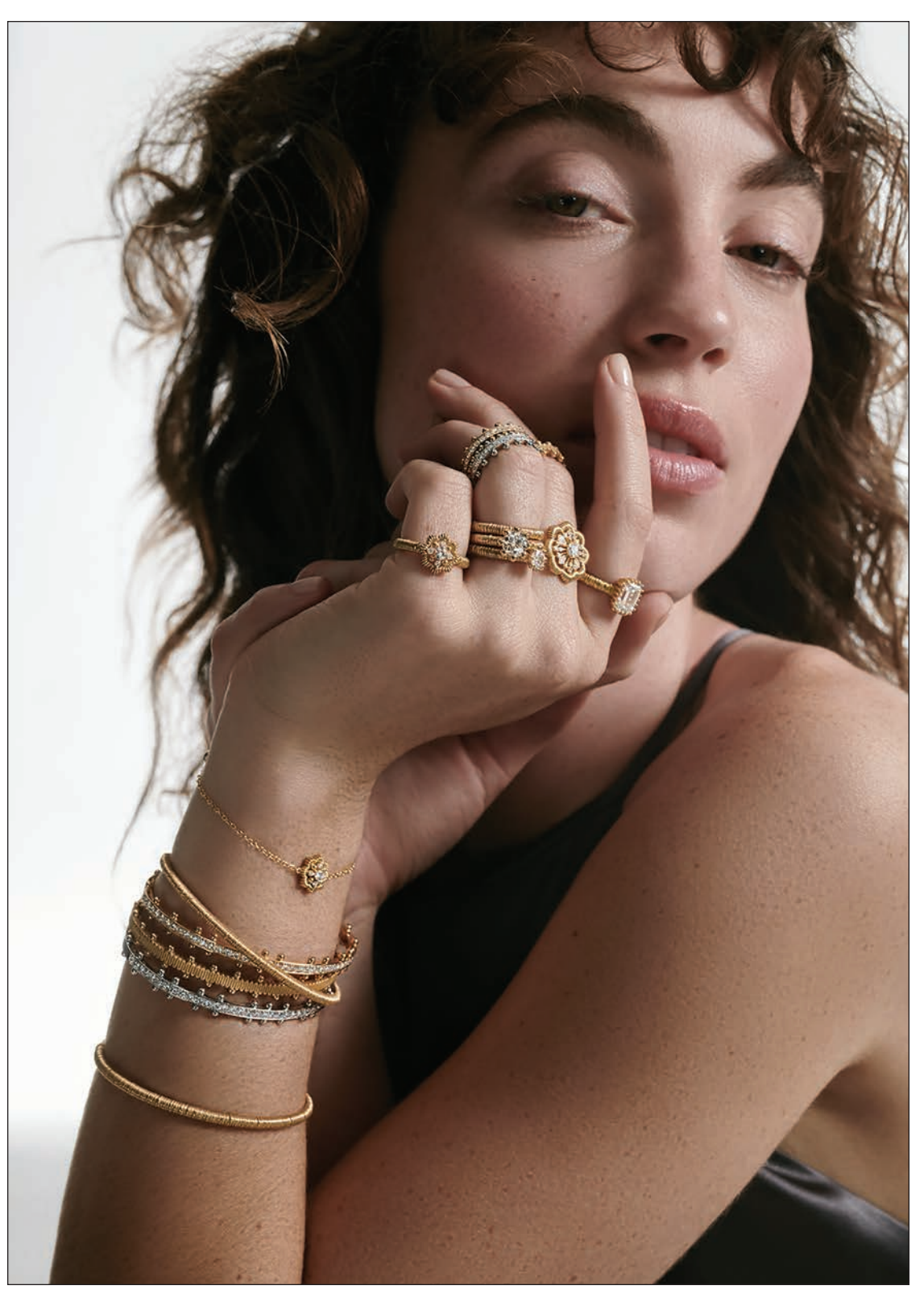
Model wearing Oscar Massin jewelry

Developing a new category requires tremendous education, because we are truly creating something that has never existed. The creation of man-made diamonds of the quality that we are using has only evolved in the last seven or eight years. It is important to note that for the new generation in the U.S., sustainability and transparency of lab-grown diamonds are critical benefits; this is a generation that appreciates the commitment to the environment, in addition to impeccable design and craftsmanship.