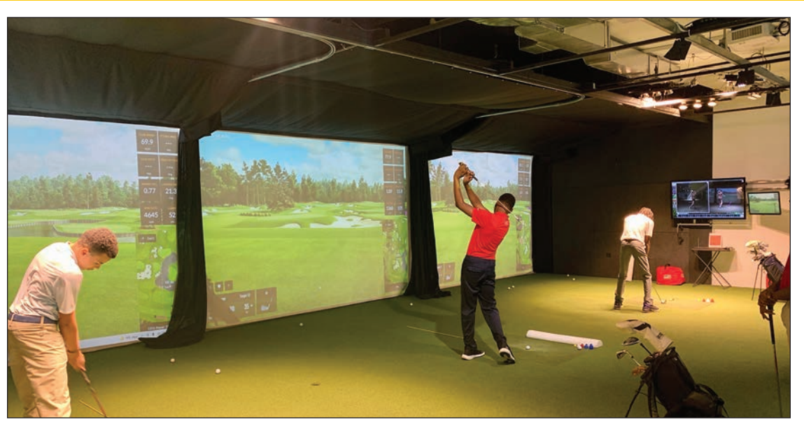
Golf simulators at The Bridge Golf Foundation facility in Harlem

Our focus is giving these young men a good educational foundation so that they can succeed. In the summer, we prioritize critical thinking which is an area they don't have time for during the school year when they are focusing on their basic math and science classes. We have a six-week summer program with four weeks devoted to an intensive critical