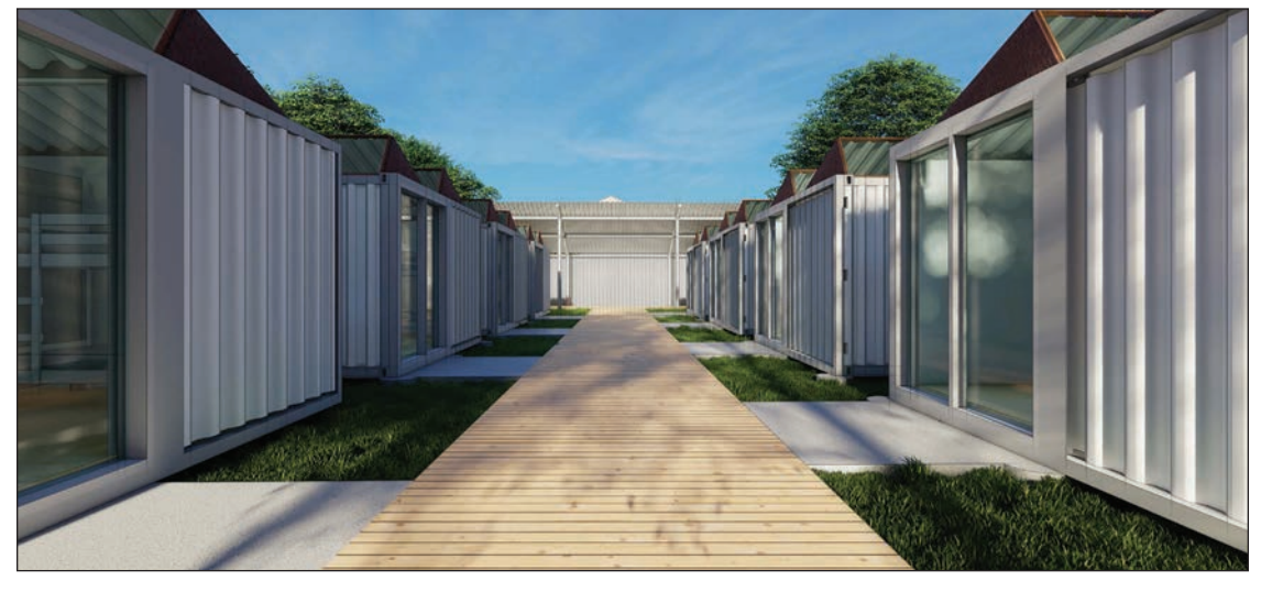
The residential complex at The Bridge can house 28 young men

When I am at The Bridge, I feel very proud of myself. When I am at the Foundation, I'm very proud of the young men. ●