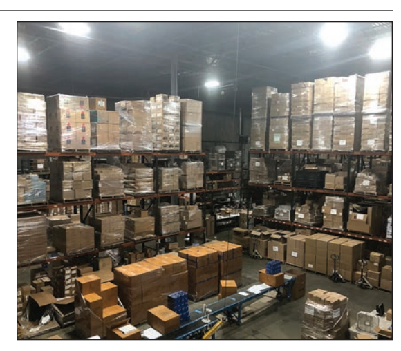
Project area at the CSS warehouse

We have the ability to purchase and warehouse extremely large quantities of merchandise. Our buying power enables us to sell major branded merchandise to smaller retailers and other venues that normally would not get the opportunity to purchase to sell these brands because they could not afford to purchase the minimum purchase amounts required. By doing this, we not only help the brand expand the number of places where their product is sold, but it also helps them achieve their targeted sales goals and increases the brand's awareness in the marketplace. We also have a drop-ship division. What this simply means is we ship merchandise directly for companies or when items are purchased online. We provide this service for them all around the world.