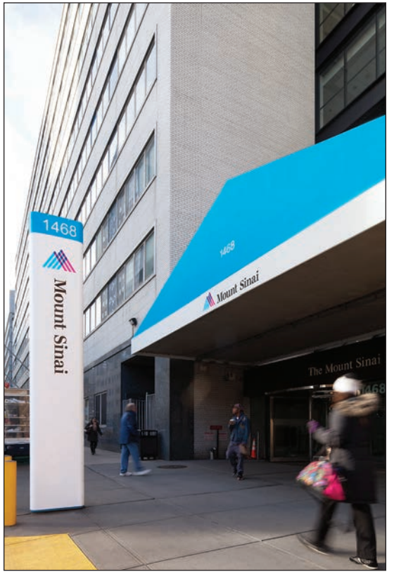
The Mount Sinai Hospital

It will be necessary for the hospital of the future to have the capabilities in case of a crisis to adapt nimbly to the needs of the time, which is a lesson learned from the pandemic.