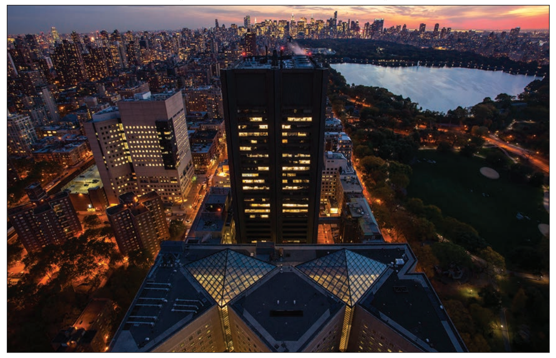
The Mount Sinai campus in New York City's Upper West Side

As a health system, we came of age during the pandemic. We are eight hospitals. Learning to function as a health system rather than a confederation of individual campuses was a moment of maturation for us. We honed our capabilities to take the sickest patients from Queens or Brooklyn and bring them into Manhattan for care; we figured out how to coordinate supplies to move ventilators that were assembled by medical students at The Mount Sinai Hospital to all of the hospitals in the health system; and we synchronized our thinking around protocols of patient care. I am very proud that Mount Sinai was the first health system to recognize and treat clotting problems that were occurring with COVID. We were the first in the world to my knowledge to develop the use of blood thinners to improve the care of patients that were in the hospital due to severe COVID and this treatment has persisted to this day.