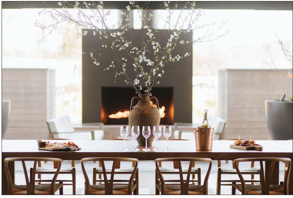
ONEHOPE Winery tasting room

started in 2007. Today, in addition to empowering our customers to give back to a cause that is important to them, we also give back to causes that focus on education, health, water, and hunger through the ONEHOPE Foundation. In 2021, we donated to many nonprofits including charity: water, Equal Justice Initiative, and Alex's Lemonade Stand. We've helped build a school in Guatemala, planted a forest in Indonesia, and we've provided over 3 million meals to children in need throughout the U.S.