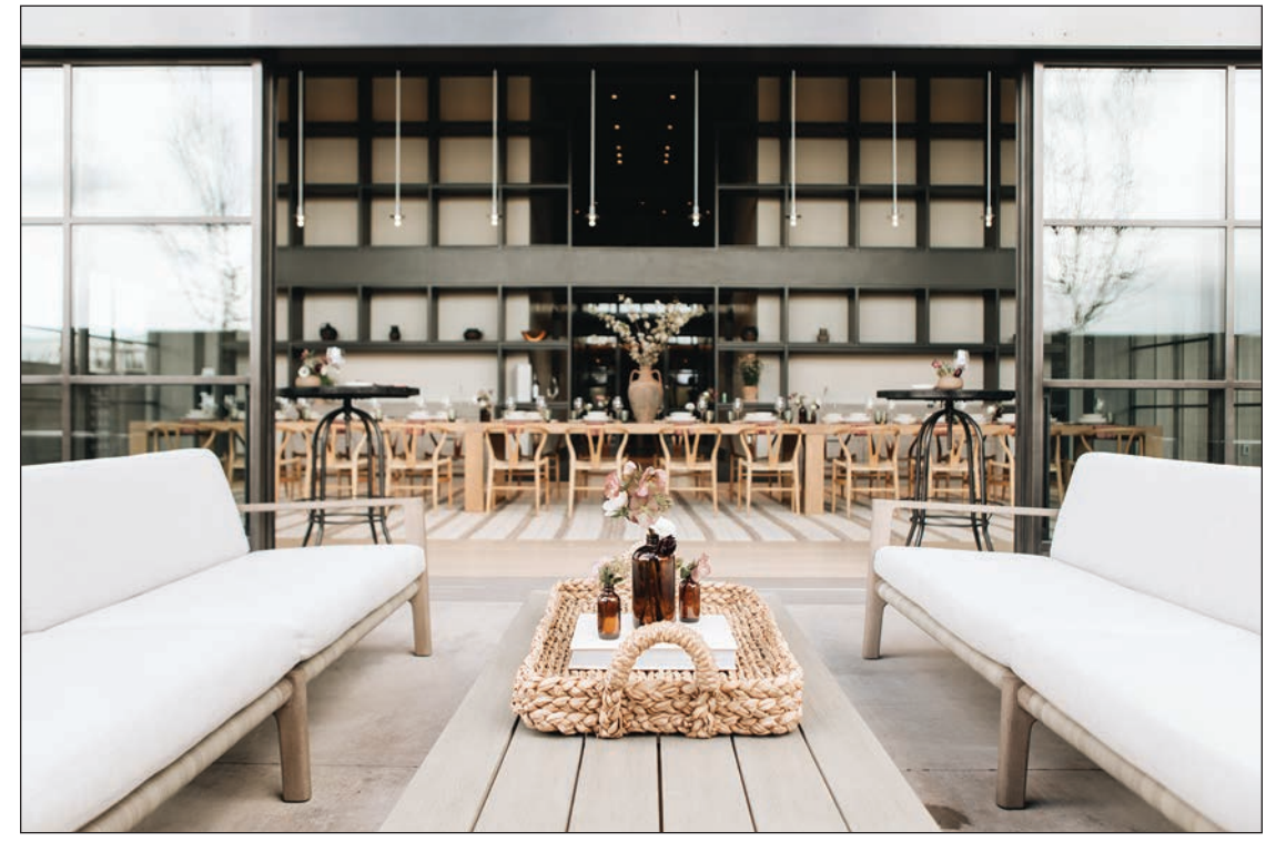
ONEHOPE Winery exterior