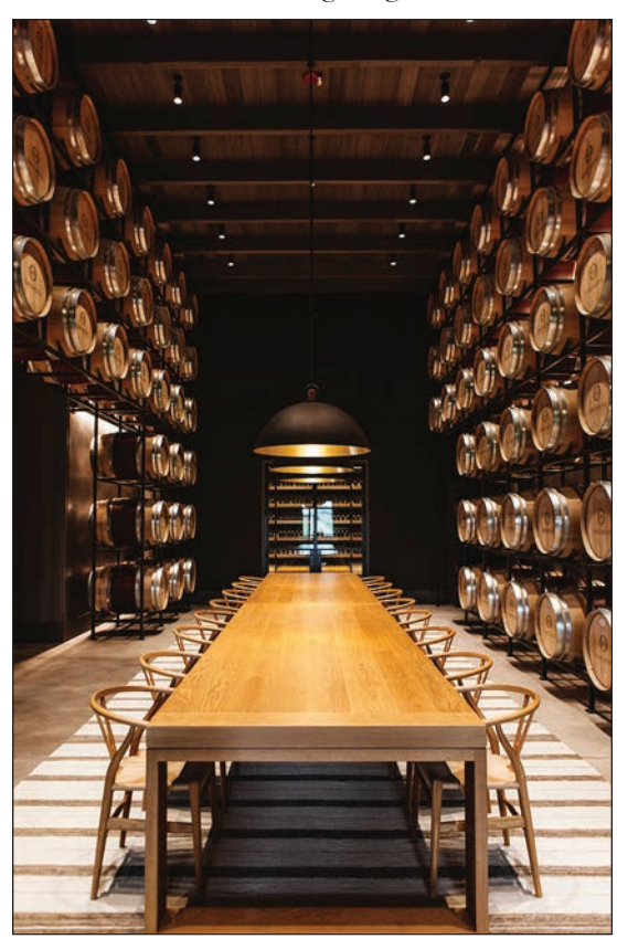
ONEHOPE Winery interior

As we've grown, our impact has grown. We've also evolved our giving model since we