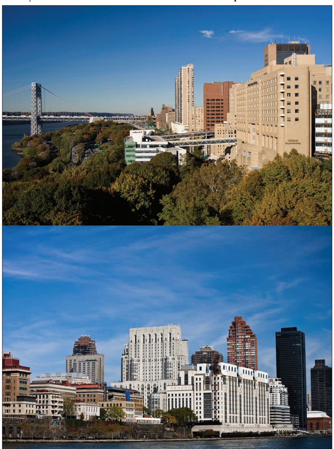
NewYork-Presbyterian/Columbia University Irving Medical Center (top); NewYork-Presbyterian/Weill Cornell Medical Center (bottom)

Will you discuss NewYork-Presbyterian's efforts to reduce and erase disparities by linking its neighbors with the world's best healthcare services and supporting them to reduce social disparities of health?