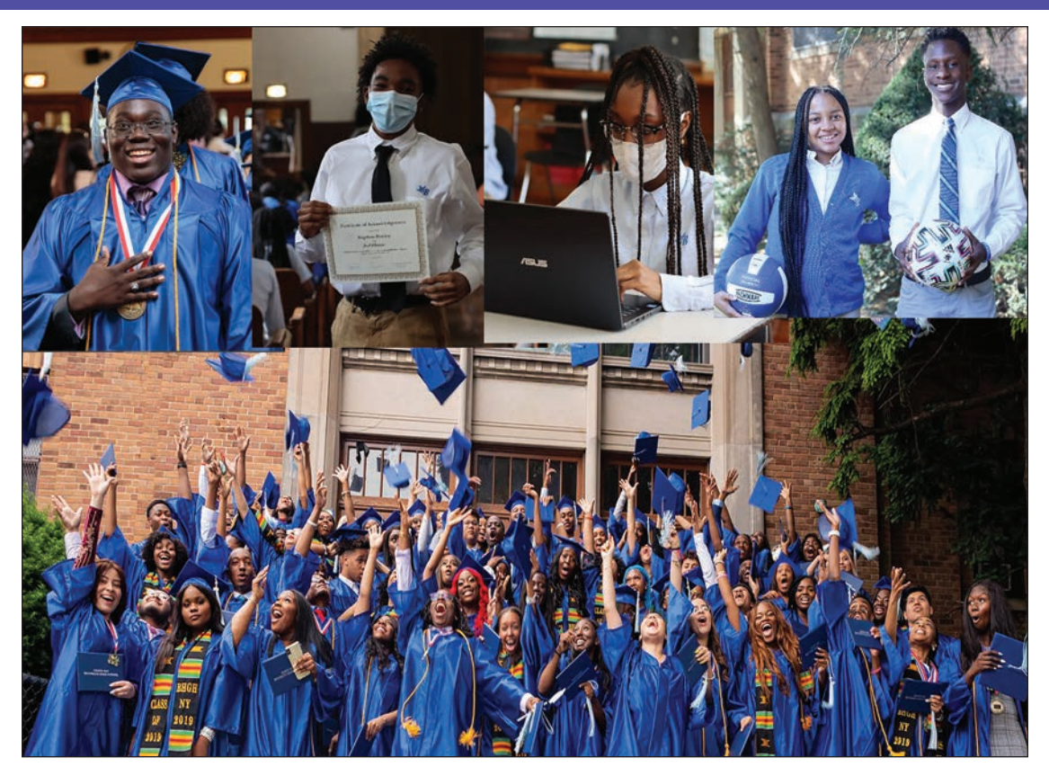
Students of Cristo Rey High School in Brooklyn, New York

employ on their own. Many philanthropic organizations and nonprofits have missions which are essential to support and develop for those in need, but they lack the managerial skills and financial resources necessary to guide a successful organization.