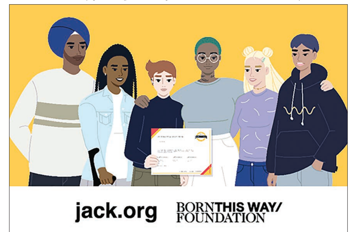
Born This Way Foundation and Jack.org partnered to create the Be There Certificate (BeThereCertificate.org), a first-of-its-kind mental health resource

In 2021, Born This Way Foundation worked with The Harris Poll to survey over 2,000 young people ages 13 to 24 in the United States to explore how kindness affects mental health, including how young people define kindness, the impact of kindness on mental wellness and how young people are using kindness to cope with overlapping and ongoing crises. Released during Mental Health Awareness Month, the results revealed an undeniable link to how kindness helps young people feel safe, confident and less alone. The survey served as a