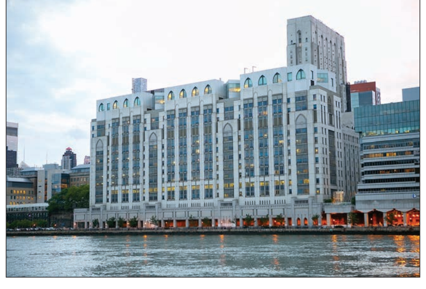
The Greenberg Pavilion at NewYork-Presbyterian Hospital

It is the responsibility of industry leaders to convey the message that insurance has an important role to play in securing many business needs in our economy. I am certain that as students understand and learn more about the industry, they will continue to be attracted to its innovation, creativity, and importance.