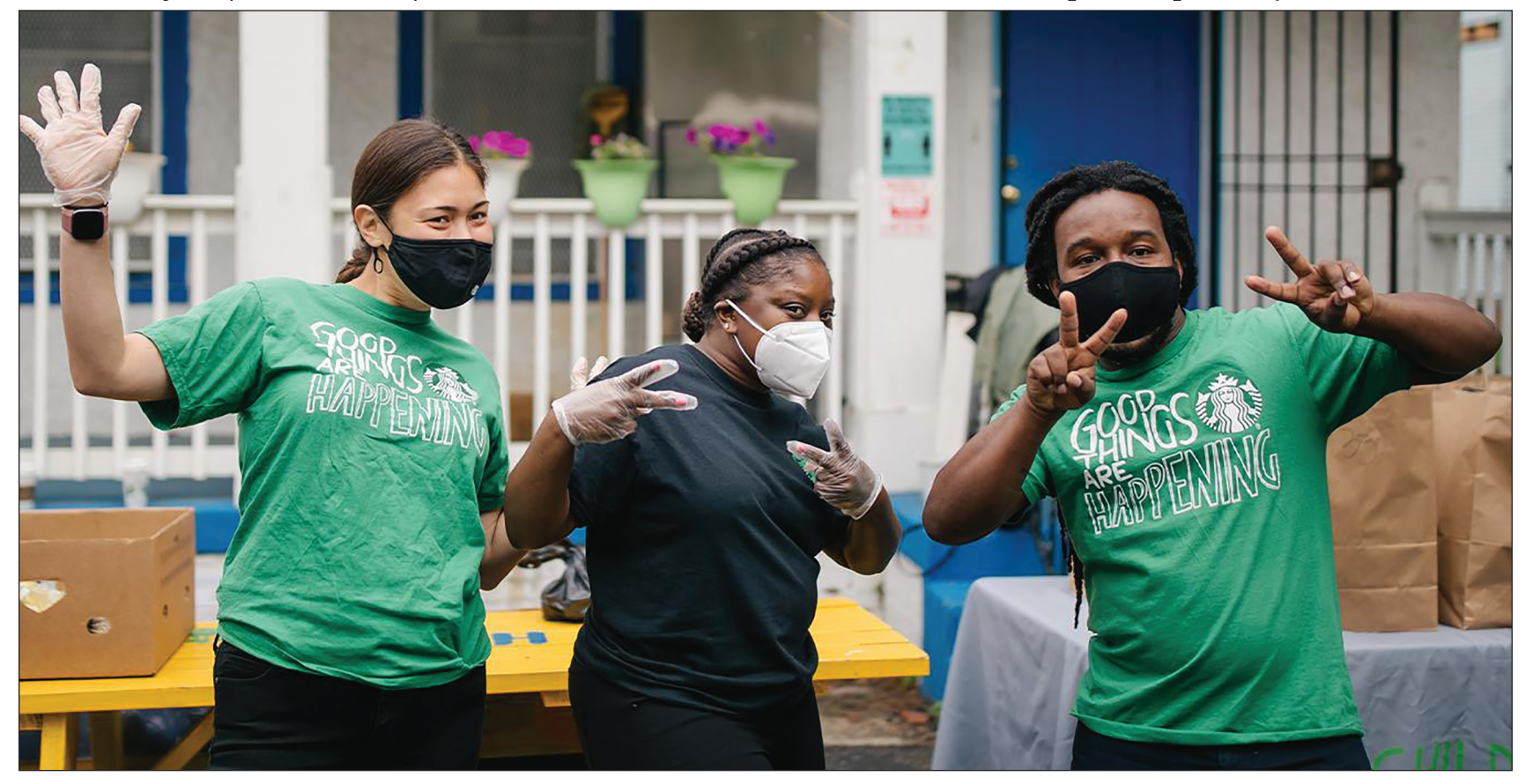
Celebrating Starbucks' equity and inclusion journey

What do you see as Starbucks' responsibility to its communities and how ingrained is corporate responsibility in Starbucks' culture?