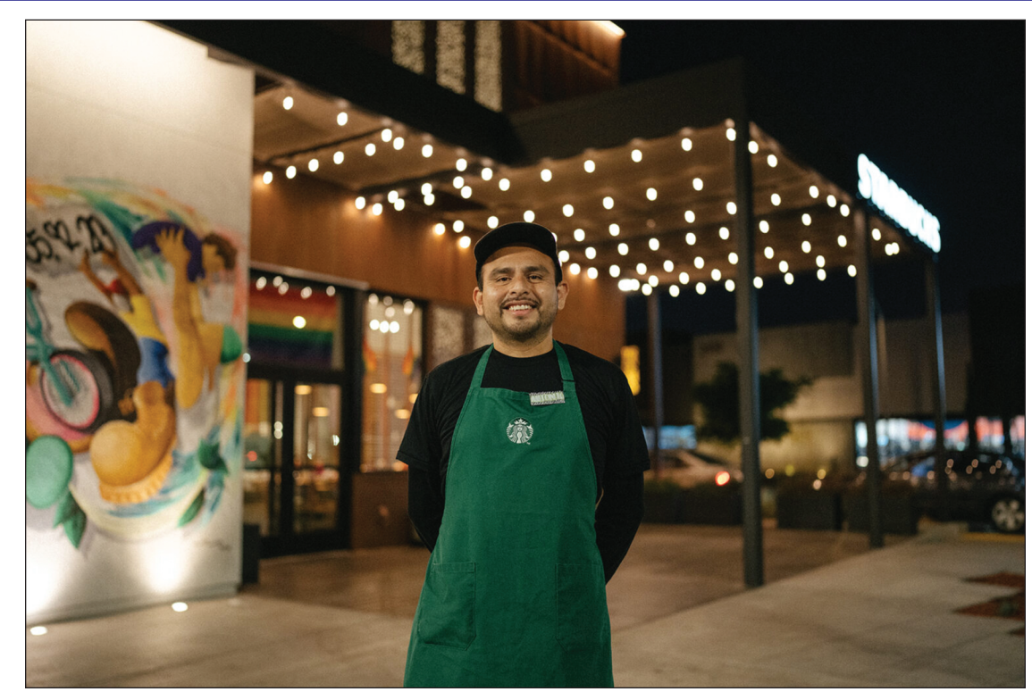
A Starbucks employee participating in one of the company's food share journeys

It's mission critical. Quite literally. Our increased focus on diversity, inclusion and opportunity has turned into a broader evolution of our culture at Starbucks. We always note that we are on a journey – one that requires us all to work together to advance racial and social equity on behalf of our partners and the communities we serve. I always come back to three principles: intention, transparency and accountability.