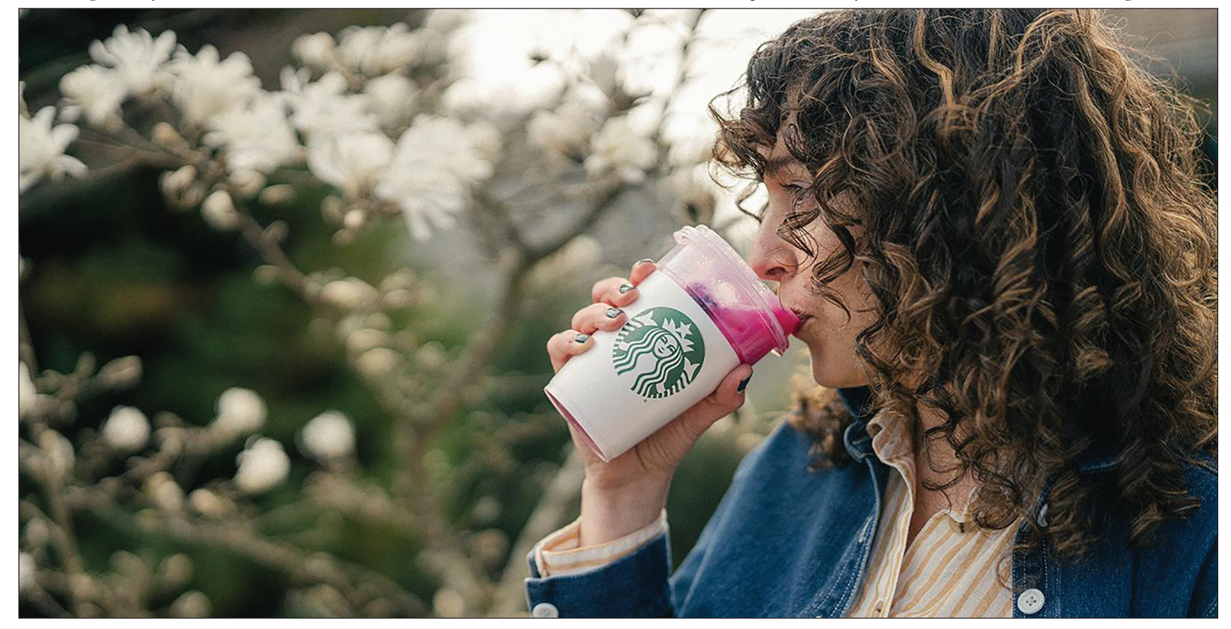
Starbucks' reusable cups are another example of its commitment to sustainability

Don't be afraid of failure, push yourself out of your comfort zone and be a lifelong learner. •