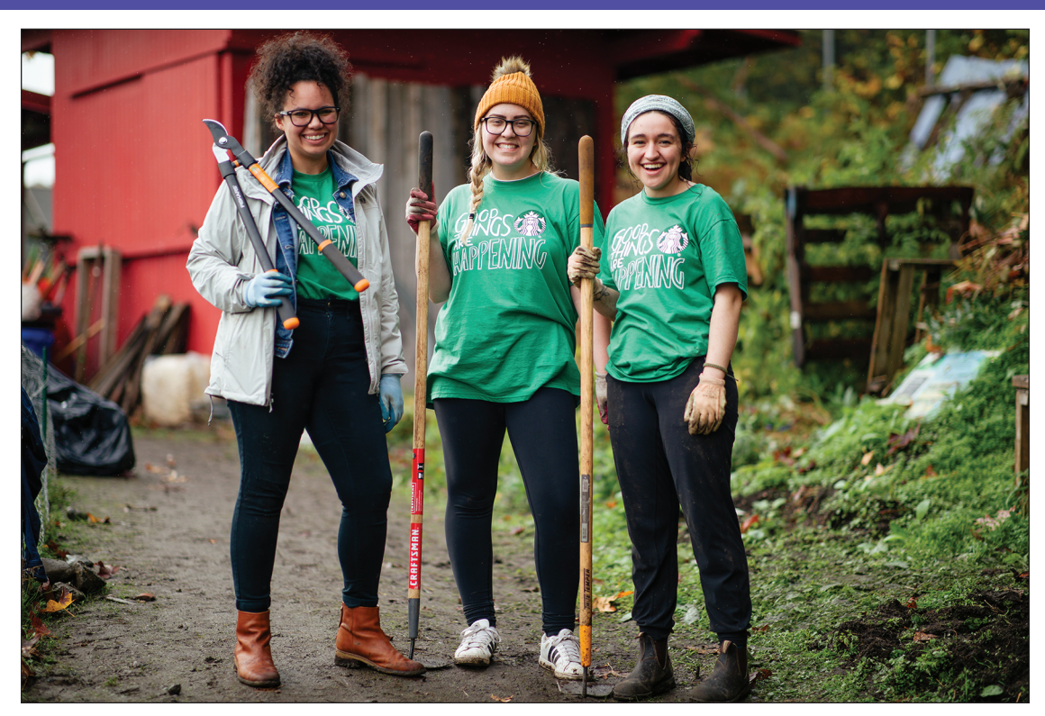
Starbucks' employees supporting the company's commitment to sustainability

My journey has been an interesting one in that I've seen several founder to successor transitions from Microsoft to Juniper to now my own at Starbucks. It seems simple, but I believe in authenticity. As a leader, you have to be willing to be your authentic self; to lean into