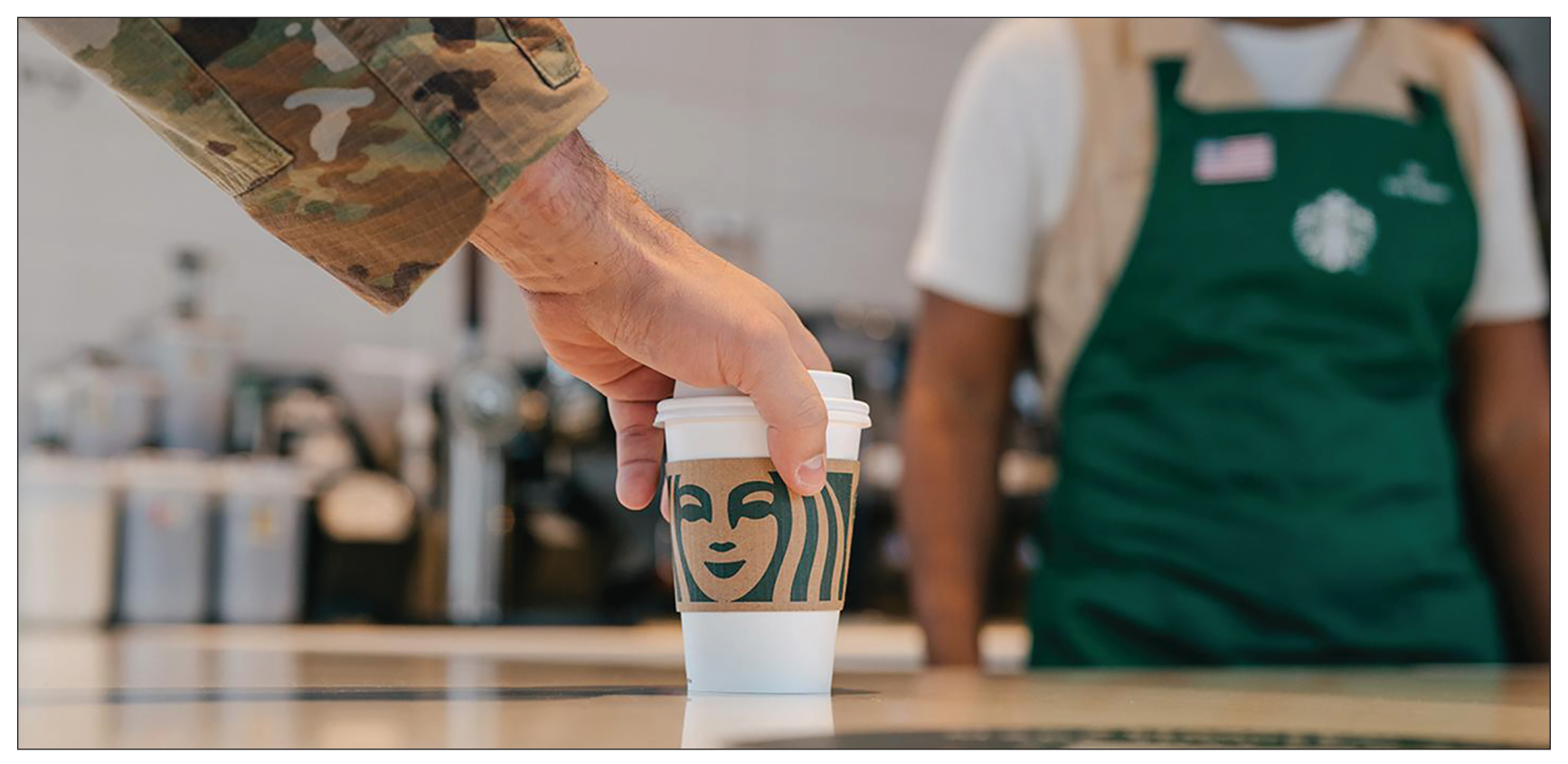
Starbucks honoring those who have served in the armed forces on Veterans Day

Over the past four and a half years, Starbucks' market capitalization has more than doubled and still, the total global addressable coffee market is expected to eclipse $400 billion in the next three years. That represents an 8 to 9 percent compound annual growth rate. With our scale and vision, we can grow even faster. By focusing on consumer behavior, we can innovate new beverage platforms, expand digital customer relationships and create new store formats. We can introduce the Starbucks Experience to a growing number of customers and satisfy their shifting preferences.