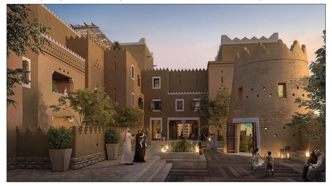
Rendering of Diriyah Square branded residential

I tell young people that tourism is an amazing industry. If you analyze all the global industries, you will not find a less discriminatory industry than tourism. It does not matter what your gender or your nationality is, if you love to serve and enjoy caring for people, it is a wonderful industry. Every day is different and there are so many facets to explore and pursue. •