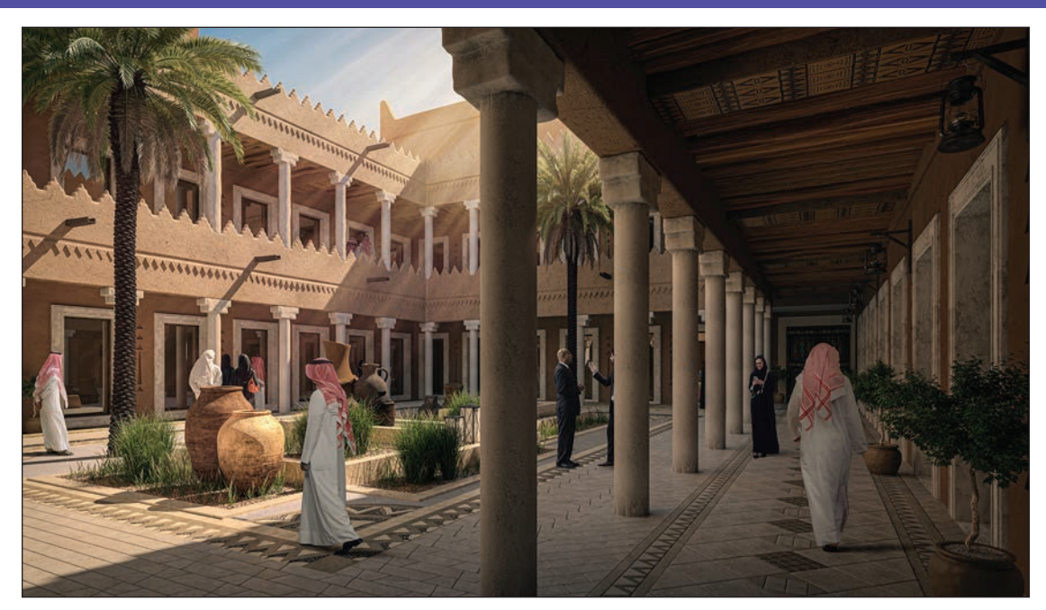
Rendering of Diriyah Square offices

It is critical. One thing that is not well known outside of Saudi Arabia is that the King is the number one historian in the Kingdom. This is important to mention since at the time when the Saudis hit oil and had vast resources available to them, it was a modest country. It then came into this vast wealth and wanted to catch up to international standards in education, health, technology, industry – helping its own people by providing opportunity for a good quality of life. His Majesty the King has been a leader in finding the balance of celebrating the past while looking forward to