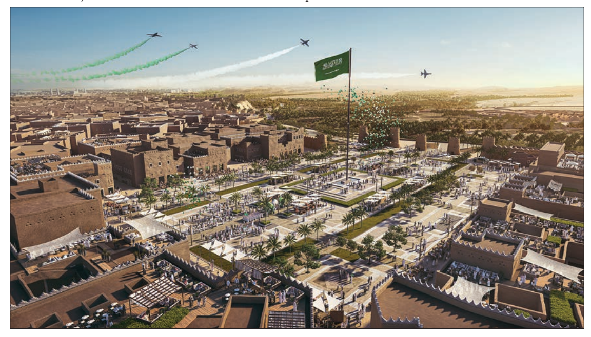
Rendering of Diriyah Gate at King Salman Square

The Kingdom of Saudi Arabia was founded in a beautiful oasis called Diriyah which was a place that attracted intellectuals and scholars.