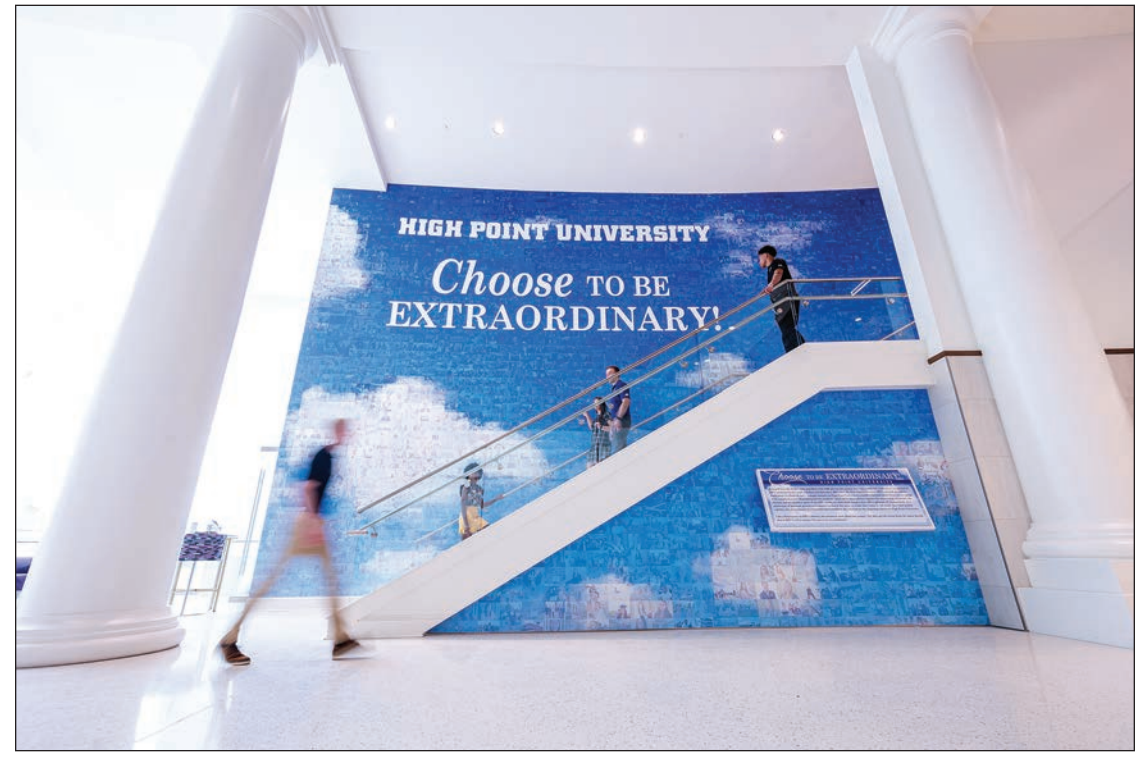
High Point University students at Qubein Arena

I believe you can encourage people to take on an entrepreneurial, growth mindset. However, that doesn't mean everyone needs to be an entrepreneur. Philanthropies, schools,