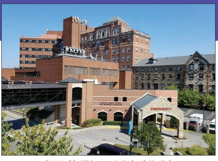
Exterior of the MSLC campus in Newburgh, New York

The key to successful leadership at MSLC is the recognition and acknowledgement that our team and medical staff are most precious. Together, we are laser focused on providing exceptional service, ensuring a positive patient and family experience at every visit, and providing high-quality, safe care that is unmatched. We were recently recognized for the third consecutive year among America's Top 250 Best Hospitals, placing MSLC in the top 5 percent of hospitals in the nation for clinical care, according to Healthgrades, and further acknowledged by Fortune as a Best Workplaces in Healthcare and Biopharma, one of only 21 hospitals in the nation recognized. This past year's recognition was even more special as we learned that Fortune also recognized us as an overall Best Workplaces in New York. However, recognizing that our teams are our most valuable, one of our greatest accomplishments is being certified as a Great Place to Work® organization for five consecutive years. There is nothing better than this type of recognition as the results are determined through direct survey of our frontline teams.