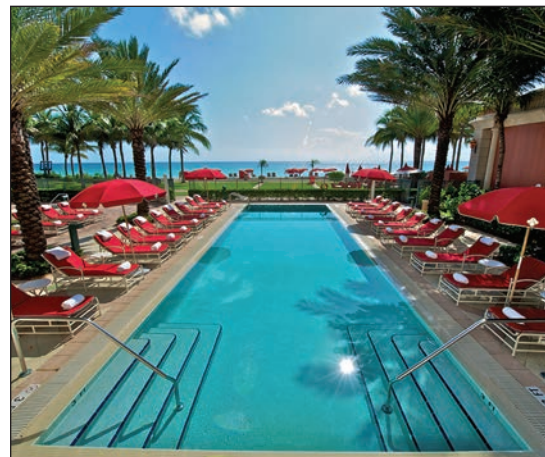
The Recreation Pool

Guests of Acqualina may also indulge in the award-winning Acqualina Spa. The skilled team of therapists creates tailored treatments to completely customize each guest's experience. Guests can unwind in the his-and-hers relaxation lounges featuring Himalayan salt walls and enjoy the crystal steam rooms, arctic ice fountains, experience showers, and Finnish dry heat saunas. Spa guests may also enjoy the oceanfront co-ed pool terrace, heated jet pool, and Roman waterfall spa.