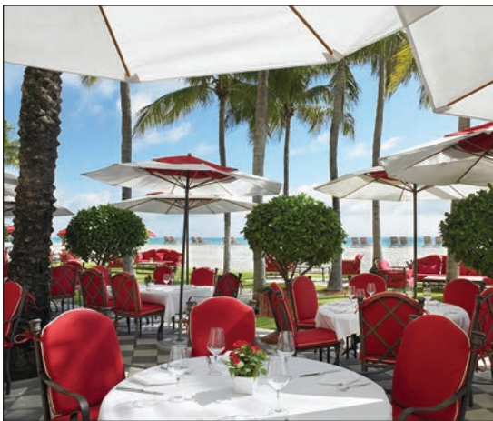
Acqualina Front Lawn (top); Costa Grill (above)

A seaside haven set on nearly five acres between Miami and Fort Lauderdale, Acqualina Resort & Residences on the Beach ( acqualinaresort.com ) is South Florida's true luxury escape. Reminiscent of a Mediterranean villa with its leisure-focused lifestyle and grand design, Acqualina is Florida's only hotel of its kind to be built completely open to the ocean, free of barriers between the 51-story tower and its 400 feet of glistening Atlantic shoreline.