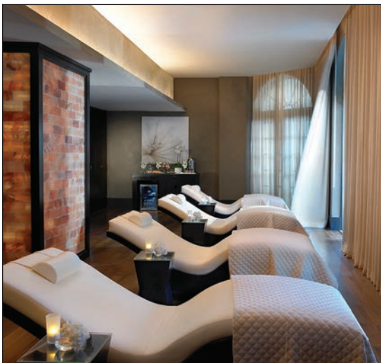
Relaxation Room at Acqualina Spa

At Acqualina, a Sunny Isles Beach Resort, guests find a collection of amenities that make the resort a true destination, including several options for on-site food and beverage service, in addition to in-room dining. The resort features Il Mulino New York, New York City's acclaimed