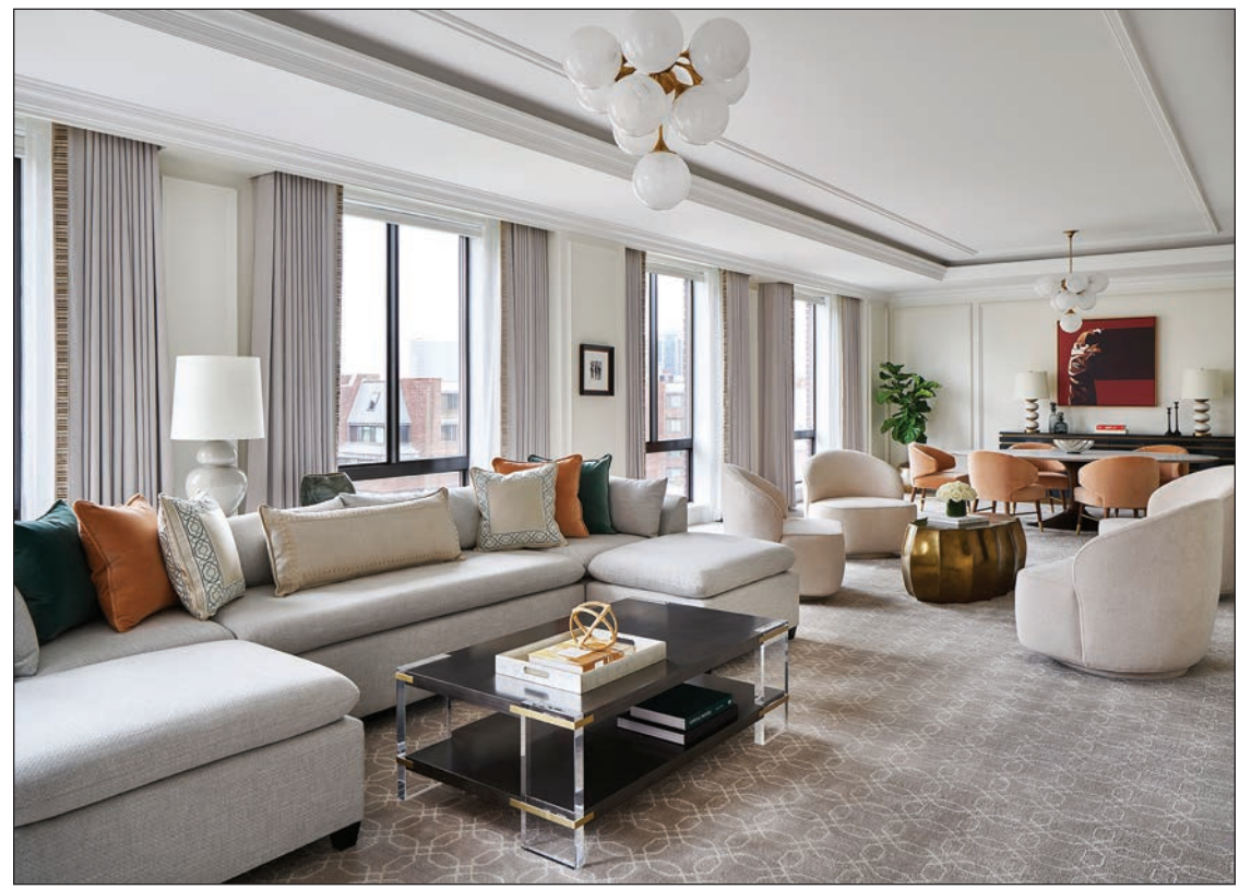
Presidential Suite - West Wing living area

on attention to detail would follow. We would be asked to clean our rooms which would lead to a room inspection. During the summers, while most of my friends were able to relax and not work, my father would arrange interviews for me at different properties where I would work in