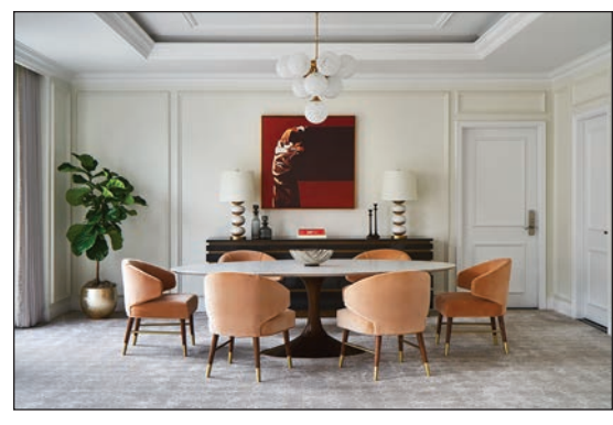
Presidential Suite - West Wing bedroom, foyer and dining room

on attention to detail would follow. We would be asked to clean our rooms which would lead to a room inspection. During the summers, while most of my friends were able to relax and not work, my father would arrange interviews for me at different properties where I would work in