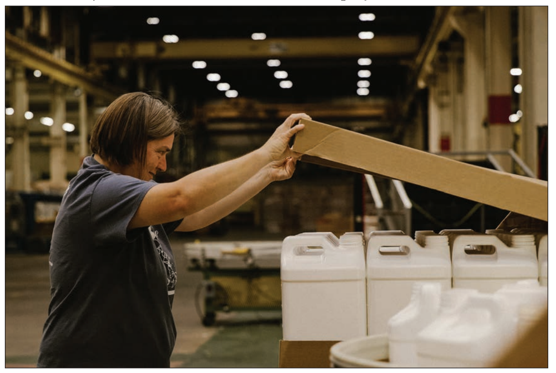
A participant in the Workforce Inclusion Now program at Lee Container in Centerville, Iowa

What do you see as the keys to effective leadership and how do you describe your leadership style?