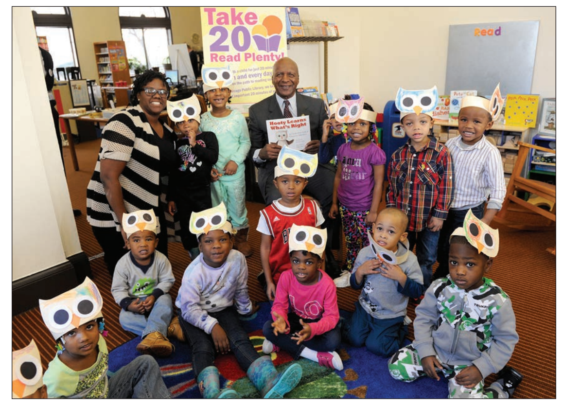
As State Librarian, Secretary White has promoted literacy at events and libraries across the state.

and professionally. My sister received a kidney transplant and lived an additional 27 years because of the gift. As Secretary of State, I head the organ donor program, and because of our donor registry and public outreach, more than 7.2 million people have registered with the program. We initiated legislation creating the First Person Consent Organ/Tissue Donor Registry, which makes a person's decision to donate legally binding. I have also championed legislation to allow 16- and 17-year-olds to register when they receive their driver's license and ID card. I will continue to promote this lifesaving program after my sixth term as Illinois Secretary of State has concluded.