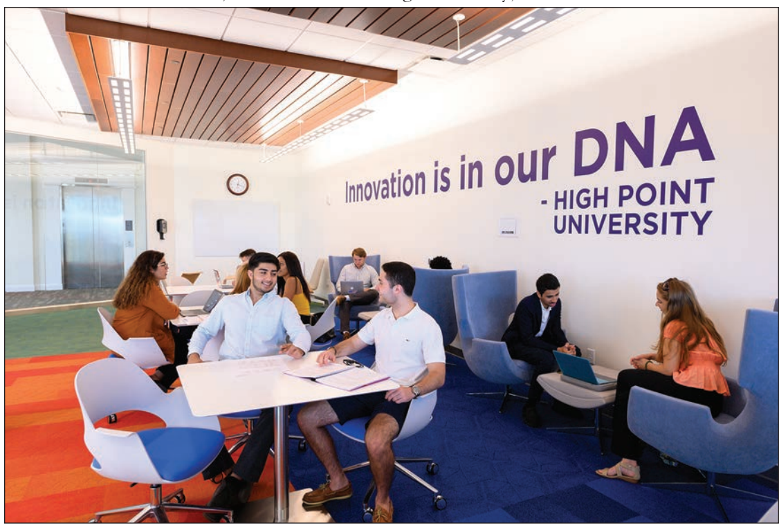
High Point University's campus is ranked among the Top 20 Most Beautiful in the Nation by The Princeton Review. HPU is also recognized as #1 Best Regional College in the South and #1 Most Innovative Regional College in the South by U.S. News & World Report.

We surround our students with dozens of accomplished individuals, in addition to our gifted faculty, because we want our students